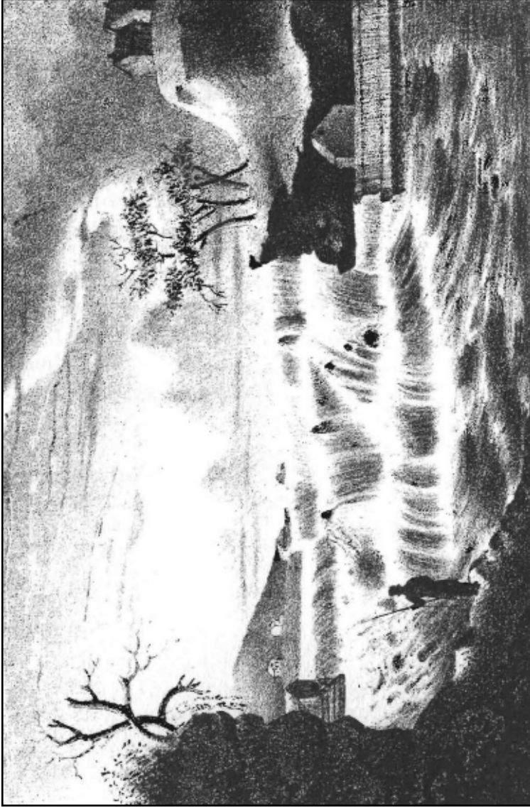
View of Saco Falls, 1829. In colonial Maine, rivers like the Saco promised easy transportation and abundant industrial energy, drawing settlers and speculators to the area. The Saco both united and divided these settlers as it shaped the towns that grew along its banks. George Folsom, History of Saco and Biddeford (1830).