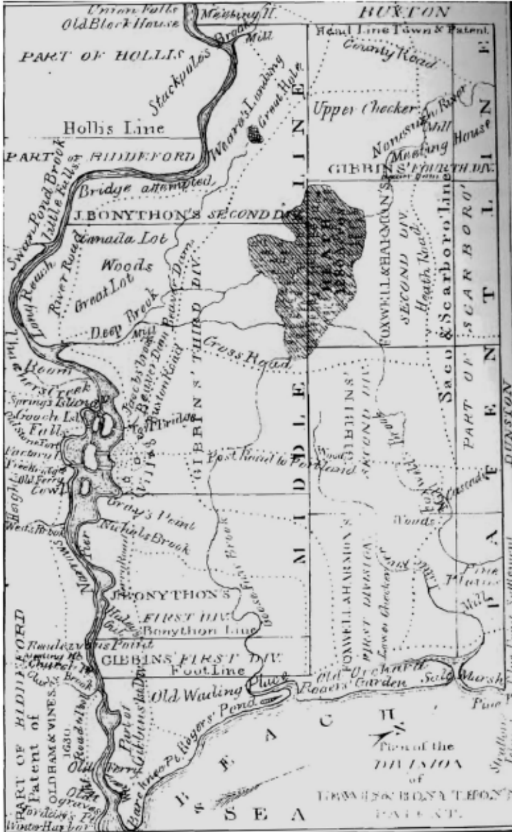
Prominent men in Biddeford and Pepperrellborough played an important role in developing the upriver community of Buxton (adjacent to the boundary in the upper right). Folsom, History of Saco and Biddeford (1830).