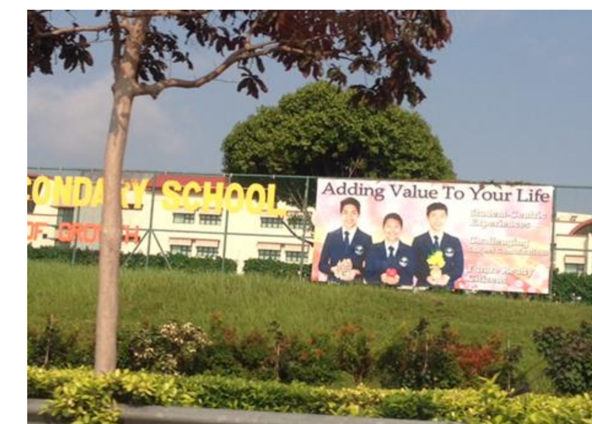
An advertisement for a secondary school reads “adding value to your life.”