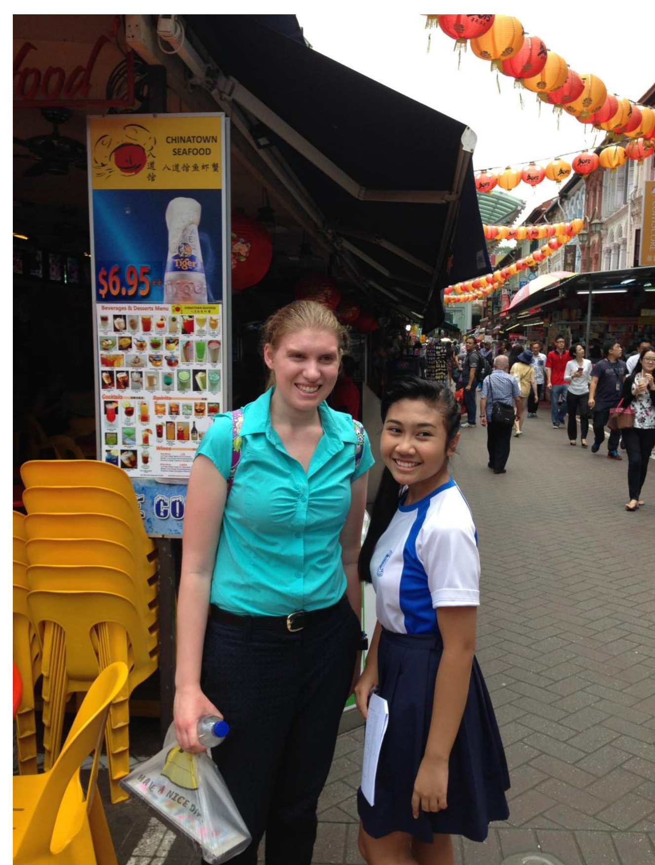
A young student in Chinatown interviewed me about my trip for a school assignment.

“Yes. Ultimately, education is very important to me. I believe with education it will help you to go far, not only career wise but also in life. I believe education is endless; there is always something new to learn every day in life until we grow. Additionally, I believe education can also help me to become a better and a more rational person. Most importantly, with education, it will provide me with better position and pay in a company. This is especially in Singapore.”