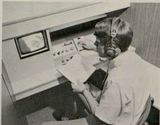
Figure 2. Student using EIS for Study.