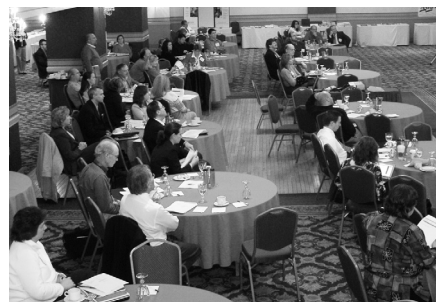
Conference attendees look on during an opening session of the 2006 MBSG and Drug Return Conferences

One track addressed issues surrounding the uses, misuse, and alternatives to benzodiazepines, a class of medications used to treat anxiety, stress and insomnia. A second focused on the environmental and societal impact of unused prescription drugs stored in homes and discarded into the environment. This