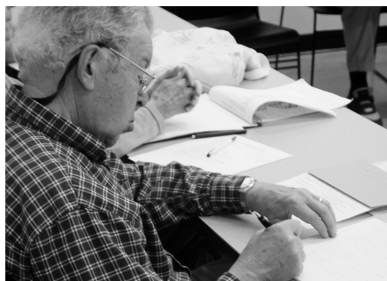
Senior College student takes notes during a class meeting