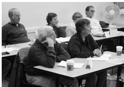
Senior College students enjoying a Friday morning seminar