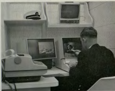
FIGURE 3. Student Carrel - CAI Instructional System