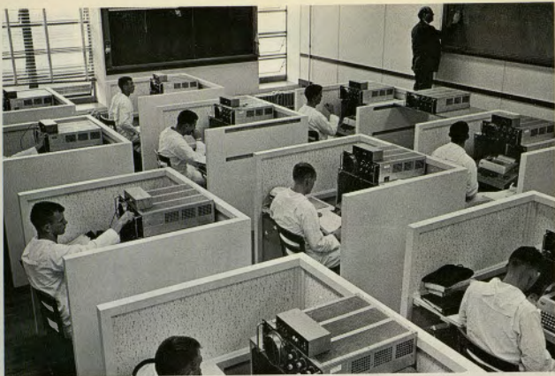
FIGURE 2. Remote Terminal "Problem Solving" Experimental Classroom