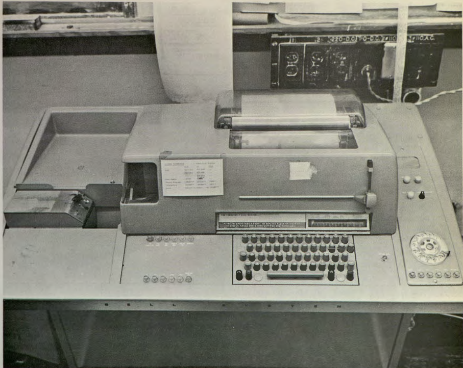
FIGURE 1. Remote Teletype Terminal - Model 35