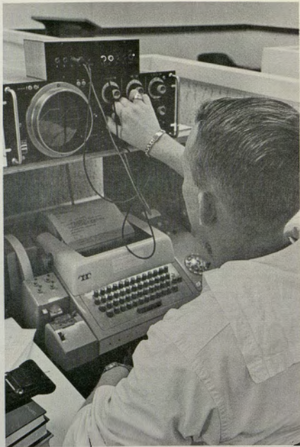
FIGURE 5. Student working on program which teaches operation of oscilloscope