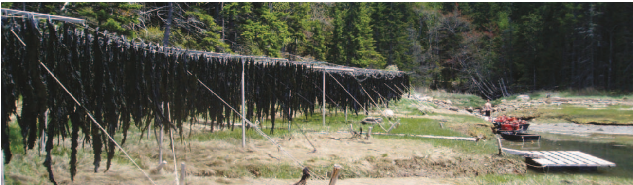
Racks of drying kelp—a scene that evokes Maine’s salt fish drying heyday.

In 2011, Redmond and colleague Dana Morse received funding from the Maine Aquaculture Innovation Center to test the feasibility of growing kelp at existing mussel farms along the coast. Morse views shellfish growers as natural candidates to become kelp farmers, since they already have the infrastructure and experience of growing food in