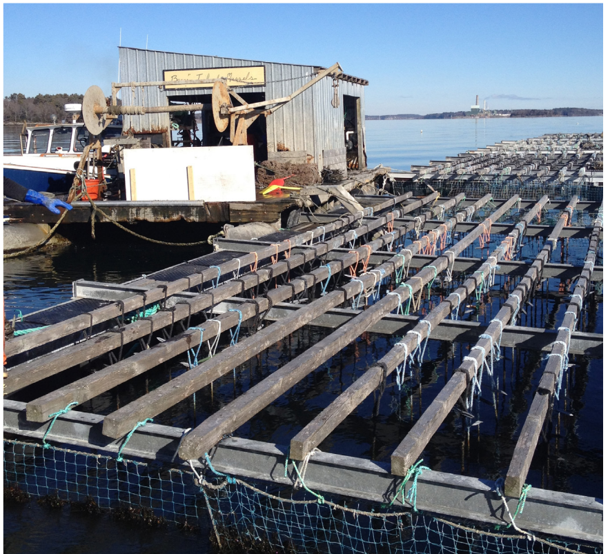
Mussel rafts at Bangs Island Mussels, Casco Bay, ME

Surprisingly, aquaculture in Maine is relatively undeveloped compared to both surrounding states and nations. Currently there are fewer than 300 full-time workers employed in the shellfish and seaweed industries in Maine, less than 5% of the number of commercial fishermen in the state.