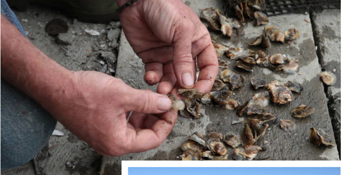
Baby oysters on North Haven, ME

While traditionally the world's supply of seafood has come from wild-caught fish, in the last fifty years, aquaculture has rapidly expanded as a food-producing industry, and now makes up almost half of the seafood consumed in the world. Much of this growth has taken place outside of the United States; however, as a country, we import 85% of our seafood, more than half of which is farmed. While it is hard to know the environmental and social impact of seafood caught and farmed overseas, by growing more of it locally, we can ensure that our morals, taste buds, and pocketbooks are happy.