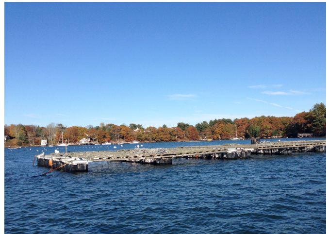
Oyster farm (left) and mussel raft (right) on the Damariscotta River, ME

The goal of these fact sheets is to inform readers about the possibilities of integrating aquaculture with current fishing and seafood businesses, and to diversify incomes along Maine's working waterfront.