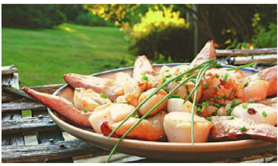
Summerhouse Scallops with Roasted Pears and Wine-Butter Sauce.

muscle to open and close their shell, a motion which propels them through the water.