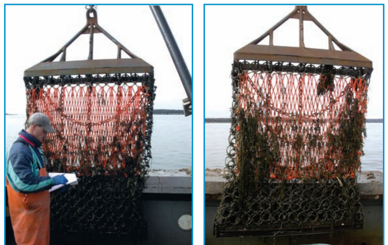
Control (3.5" ring) drag on the left, and the Experimental drag (4" ring) on the right. Twine top differences visible.

Drags were built by Blue Fleet, Inc. of New Bedford, MA. The drags measured 5.5' (1.7m) between the outside edges of the shoes, in compliance with size limitations for Cobscook Bay. Head bails were constructed of 2" (50mm) round iron stock. Twine tops were 6" (152mm) diamond mesh. Since both vessels are set up to empty drags through the club end, the drags were equipped with a 'pocketbook' style dump. NOTE: An error resulted in the twine tops being different between the two drags, with the Control drag being hung with a 3:1 ratio, and the Experimental drag hung at 2:1 (51 vs. 36 meshes across).