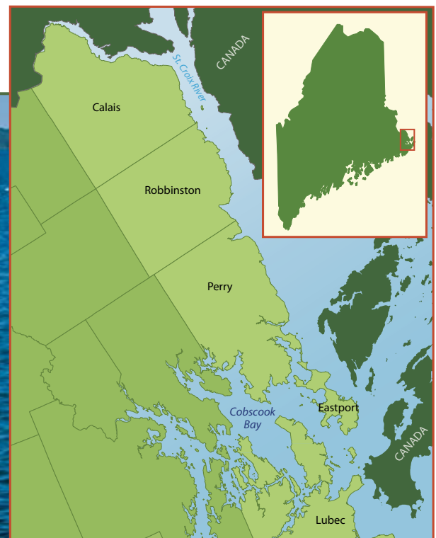
Figure 1 Cobscook Bay, Maine