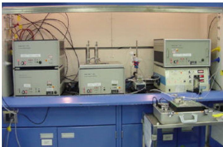
Figure 1 – Vapor Generation System

Test vapors were generated using calibrated permeation devices (PD) and ovens (Kintek Model 360). Table 2 summarizes the vapors generated for this research. Vapors from the vapor generators were either used directly or blended with air from a temperature, humidity and flow rate controller (Miller-Nelson Model HCS-40), providing dilution factors up to 25. See Figure 1.