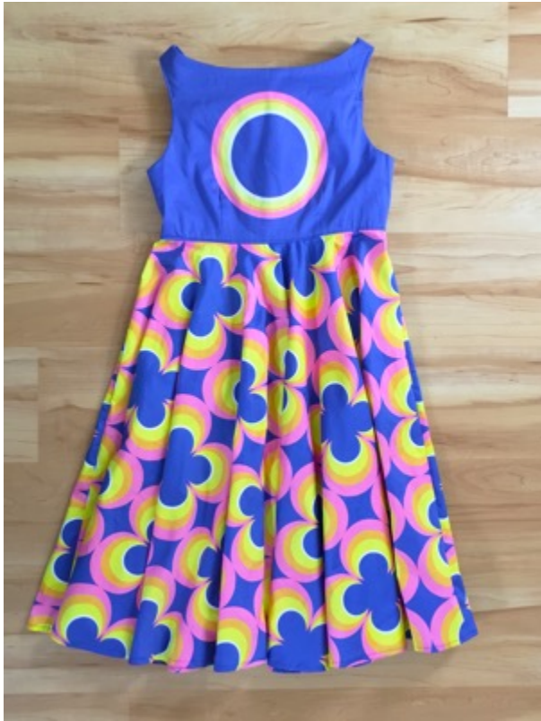
Figure E: First Impressions - Dress