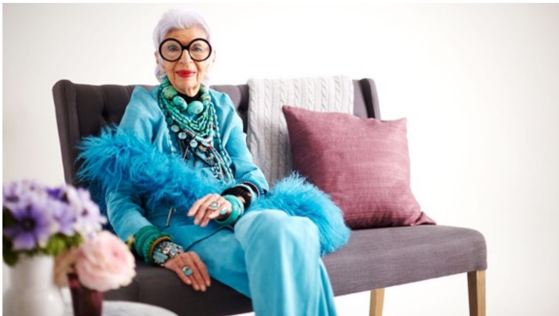
Figure G: Iris Apfel at One Kings Lane's NYC offices, 2014