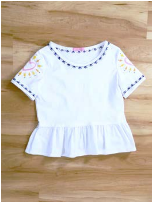
Figure B: Everyday - Embroidered Top

fly, which I had to experiment with to figure out the mechanics of. I had sewn in zippers before, but this was my first attempt at incorporating it as a part of a fly, so I kept working with it until I figured out a way that was successful. The most difficult part of the jeans beyond just getting the fit right was creating the buttonhole. The layers of denim were so thick that it was hard to get my sewing machine to successfully stitch through, and ripping the hole was also very difficult. I chose a button that was smaller but a similar style to that chosen for the coat, gold metallic with a hammered texture, referencing the blue and gold of the faux fur coat. It takes a few times wearing a pair of jeans for the fabric to start to relax, so they are still somewhat stiff and the button can be difficult to maneuver at times, but the more they are worn, the easier they become to wear. The top and jeans are shown below in Figure B and Figure C, respectively.