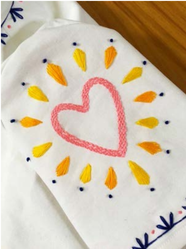
Figure K: Everyday - Embroidered Top (detail)