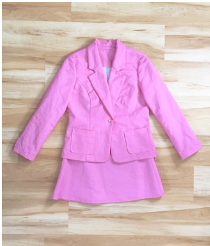
Figure D: Professional - Pink Suit (Blazer and Skirt)

Much like the jeans, the suit's skirt required a lot of modification from the pattern sizing to fit properly. A zipper was installed on the side with a sewn on snap closure added to further secure it, with a decorative button added on the exterior using the same type as on the jeans. The blazer, though comprised of many pieces and likely the most complicated construction of the pieces made in this thesis, went together much as expected according to my research in the pattern and garment type with minimal additional tailoring required. The most difficult part was getting the lapels to lay flat with no puckers after attaching the facing and flipping it back to show the right side of the fabric. I created a button closure on the blazer, again using the same type as on the other pieces. Pockets were added on the front exterior as a stylistic element, but also as a solution to never having functioning pockets in blazers, as they are usually stitched shut for appearance. Interior edges were finished using pinking shears to prevent fraying. The completed suit is shown here, in Figure D.