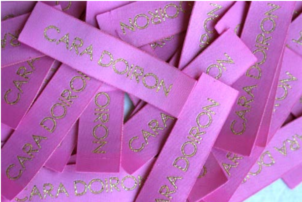
Figure H: Woven Labels