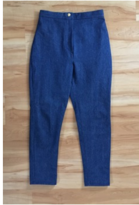
Figure C: Everyday - Jeans