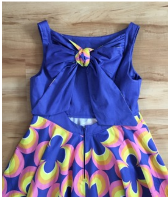
Figure F: First Impressions - Dress (back detail)