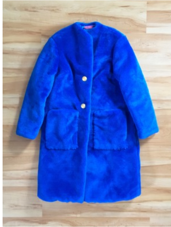
Figure A: Cold Weather - Blue Faux Fur Coat

feeling that the coat itself had. The circular shape is simple but is made more grand with the shiny gold finish and hammered appearance. The coat is shown at right in Figure A.