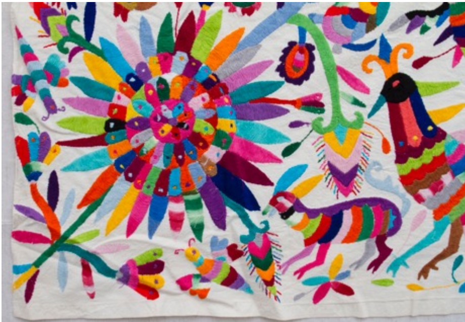
Figure I: Otomi tenango (embroidery) from Mexico