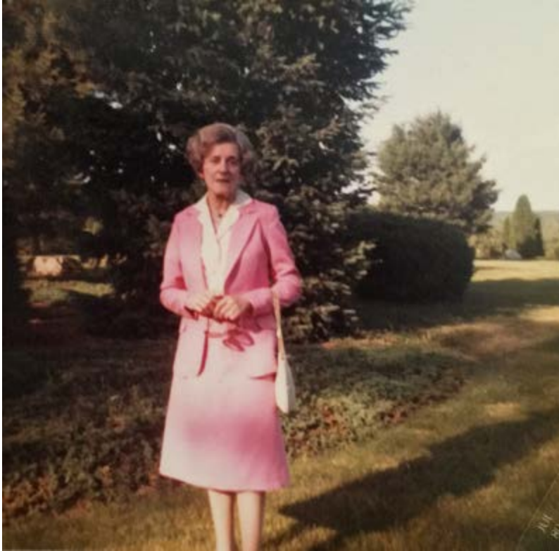
Figure L: My Grandmother in July of 1980 in her pink suit