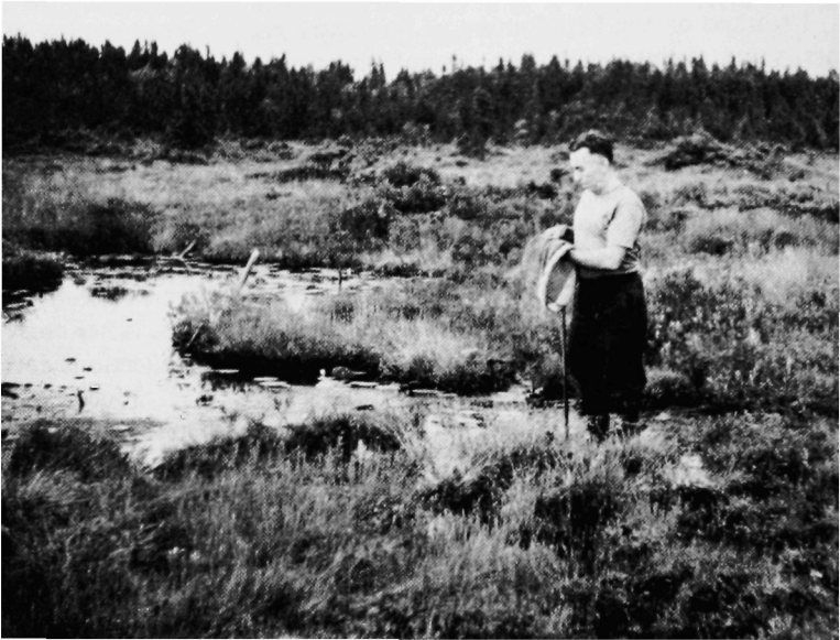
The author at a relict glacial pool near Southwest Harbor, Maine, type locality for Nymphula broweri Heinrich. These pools seem to be unusual in the northeast, but this species has been taken by the author in eight locations of this type in Maine. No out-of-state records are known.

of species from the area and the most accurate names possible. Exchanging for and purchasing additional species of this area to assist in determinations has continued.