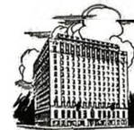
PERE MARQUETTE Peoria, Ill.