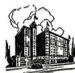
SENECA Rochester, N. Y.