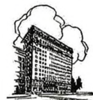
RADISSON Minneapolis, Minn.