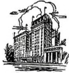
ONONDAGA Syracuse, N. Y.