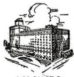
CORONADO St. Louis, Mo.