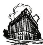
SINTON Cincinnati, O.