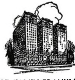
BENJAMIN FRANKLIN Philadelphia, Pa.