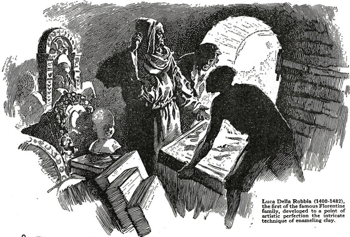
Luca Della Robbia (1400-1482), the first of the famous Florentine family, developed to a point of artistic perfection the intricate technique of enameling clay.