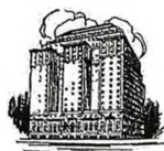
ROOSEVELT New York, N. Y.