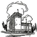
KING EDWARD Toronto, Can.