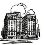
CALIFORNIAN Fresno, Calif.