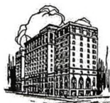
MOUNT ROYAL Montreal, Can.