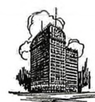
BLACKSTONE Chicago, Ill.