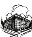
PALACE San Francisco, Calif.