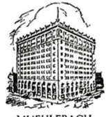
MUEHLEBACH Kansas City, Mo.