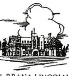
URBANA-LINCOLN Urbana, Ill.