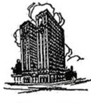
WOLVERINE Detroit, Mich.