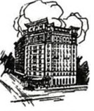
SAINT PAUL St. Paul, Minn.