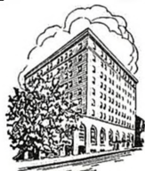
BETHLEHEM Bethlehem, Pa.