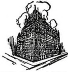
WALDORF-ASTORIA New York, N. Y.