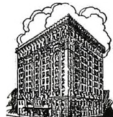
MONTELEONE New Orleans, La.