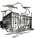
MULTNOMAH Portland, Ore.