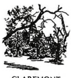
CLAREMONT Berkeley, Calif.