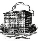
SCHENLEY Pittsburgh, Pa.