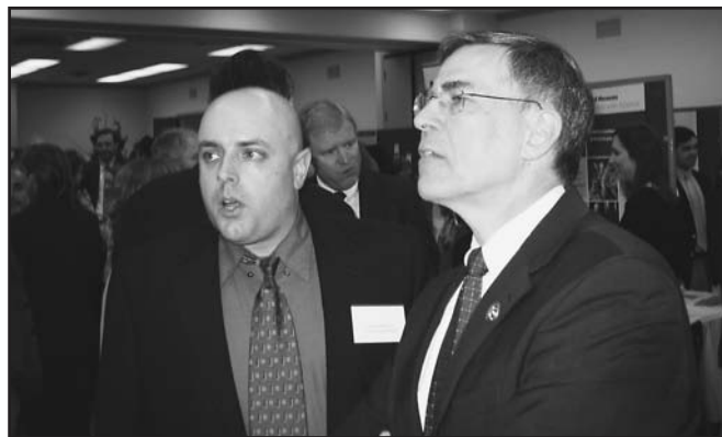
David Hiebeler with Rep. Rush Holt (NJ-12).

Hiebeler’s exhibit used information and computer simulations to describe his work in three different areas: (1) determining the best strategy for applying pesticides or other measures to control invasive insect species in Maine’s agriculture while using fewer chemicals; (2) using epidemiological models to explore the implications of clustering within certain socioeconomic groups of people who choose not to be vaccinated or to have their children vaccinated against infectious diseases; and (3) modeling the effectiveness of new biological dispersal strategies in the spread of computer viruses and “worms” by malicious software and also exploring methods for helping to control such outbreaks.