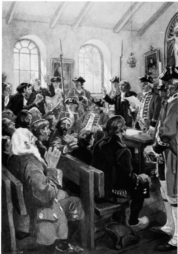
IN THE PARISH CHURCH AT GRAND PRIÉ, 1755