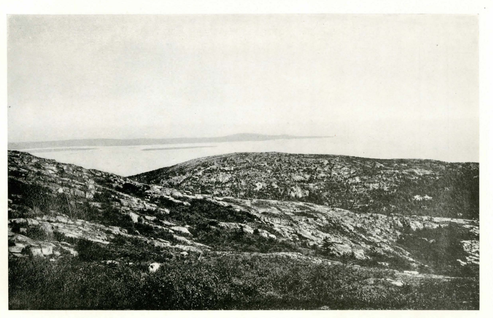
The waters of Champlain's approach from the "Saincte Croix" colony to Frenchmans Bay, and the "Monts deserts" he saw