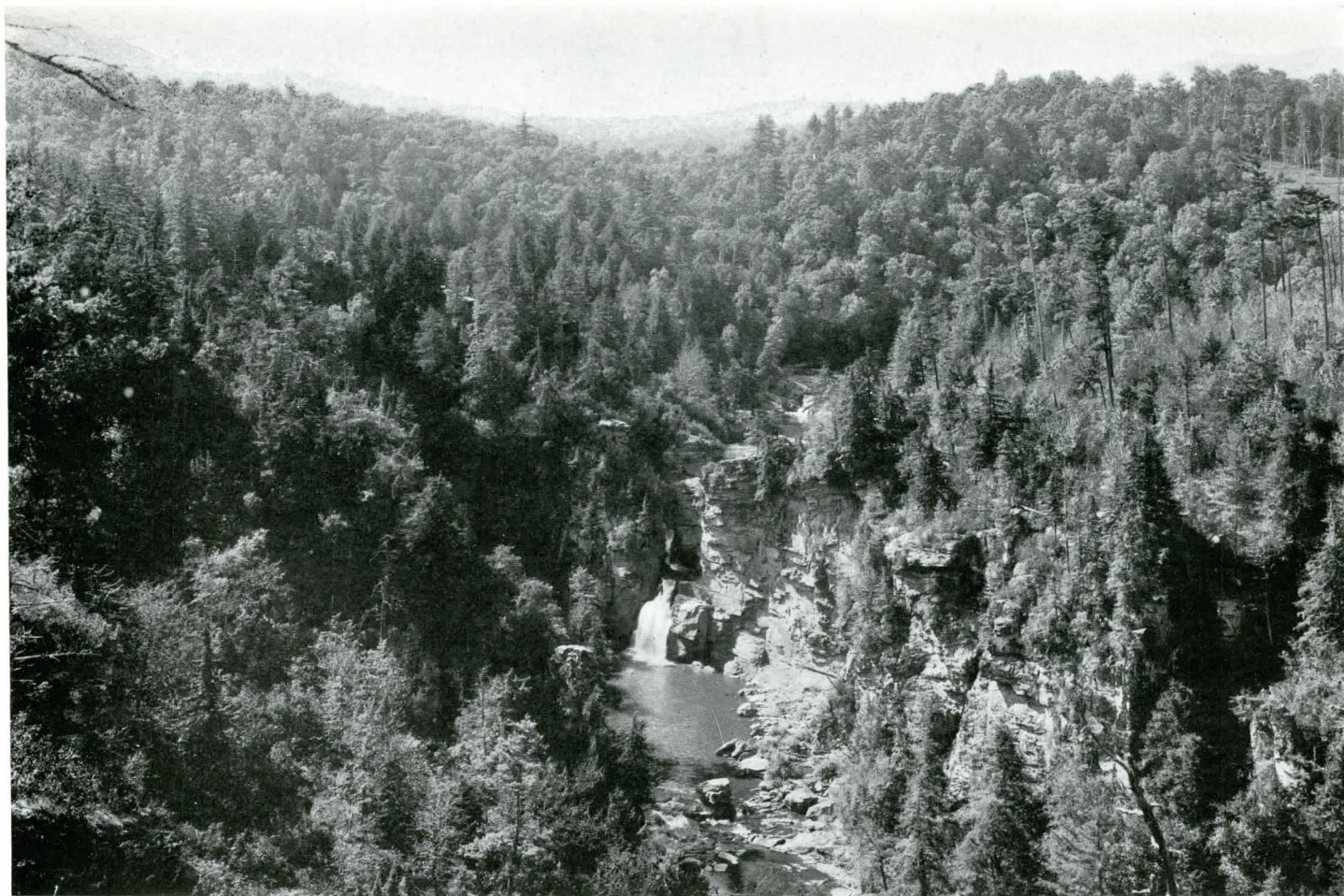
Water lending beauty and refreshment to a Southern Woodland