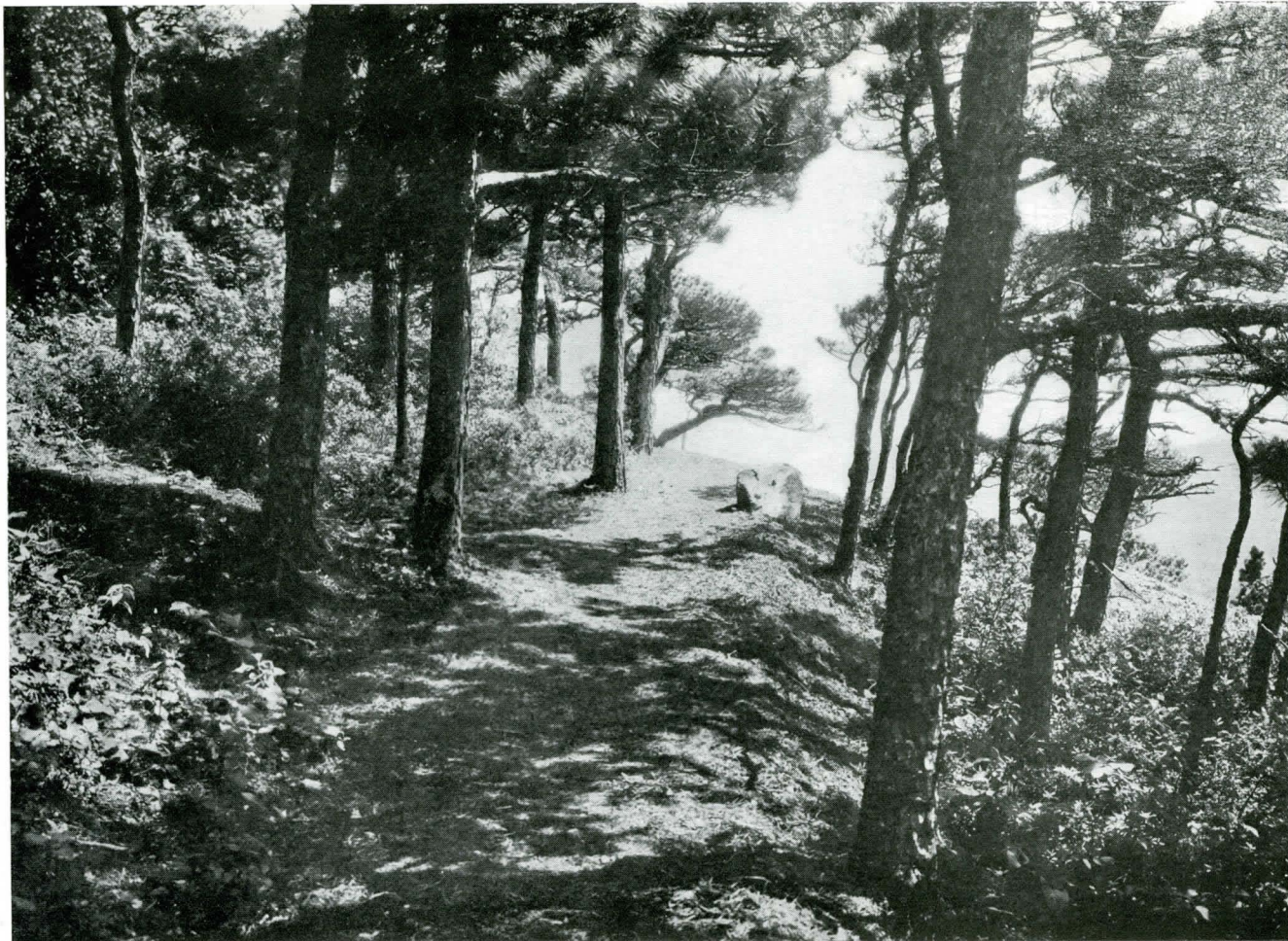
The path to Huguenot Head and a great ocean view; Sieur de Monts national park