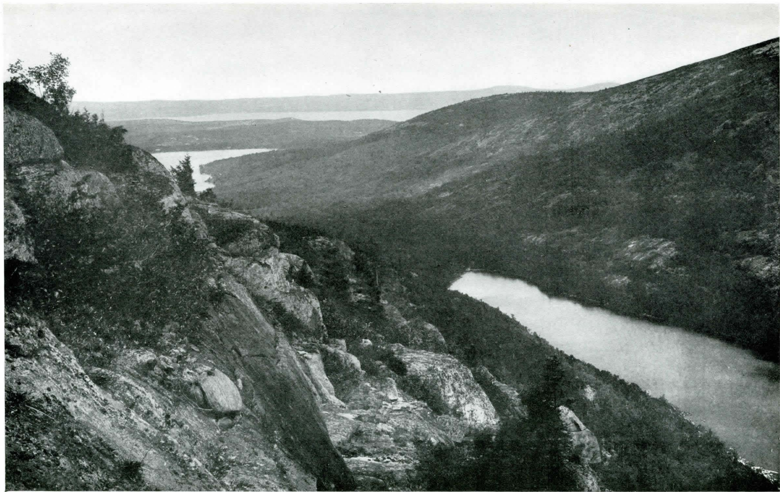
Lakes in the Sieur de Monts national park—Looking north toward the Mainland