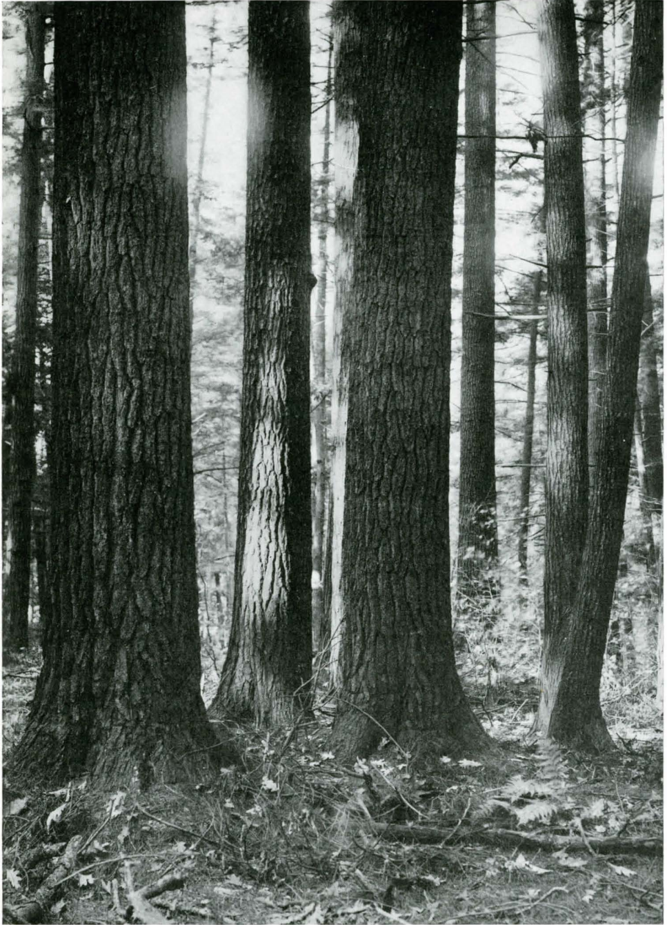
Giant Pine-trees in the north