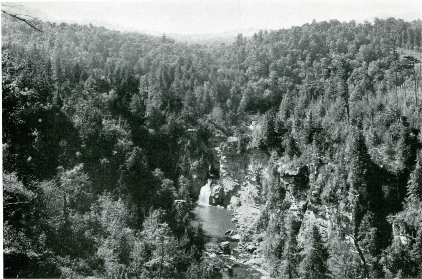
Water lending beauty and refreshment to a Southern Woodland