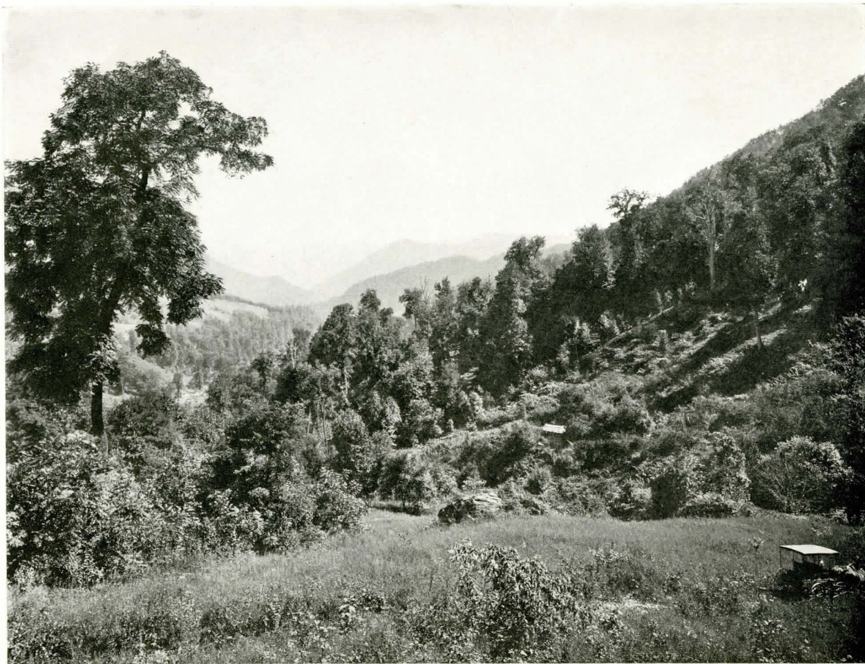
A beautiful landscape in the Southern Appalachians