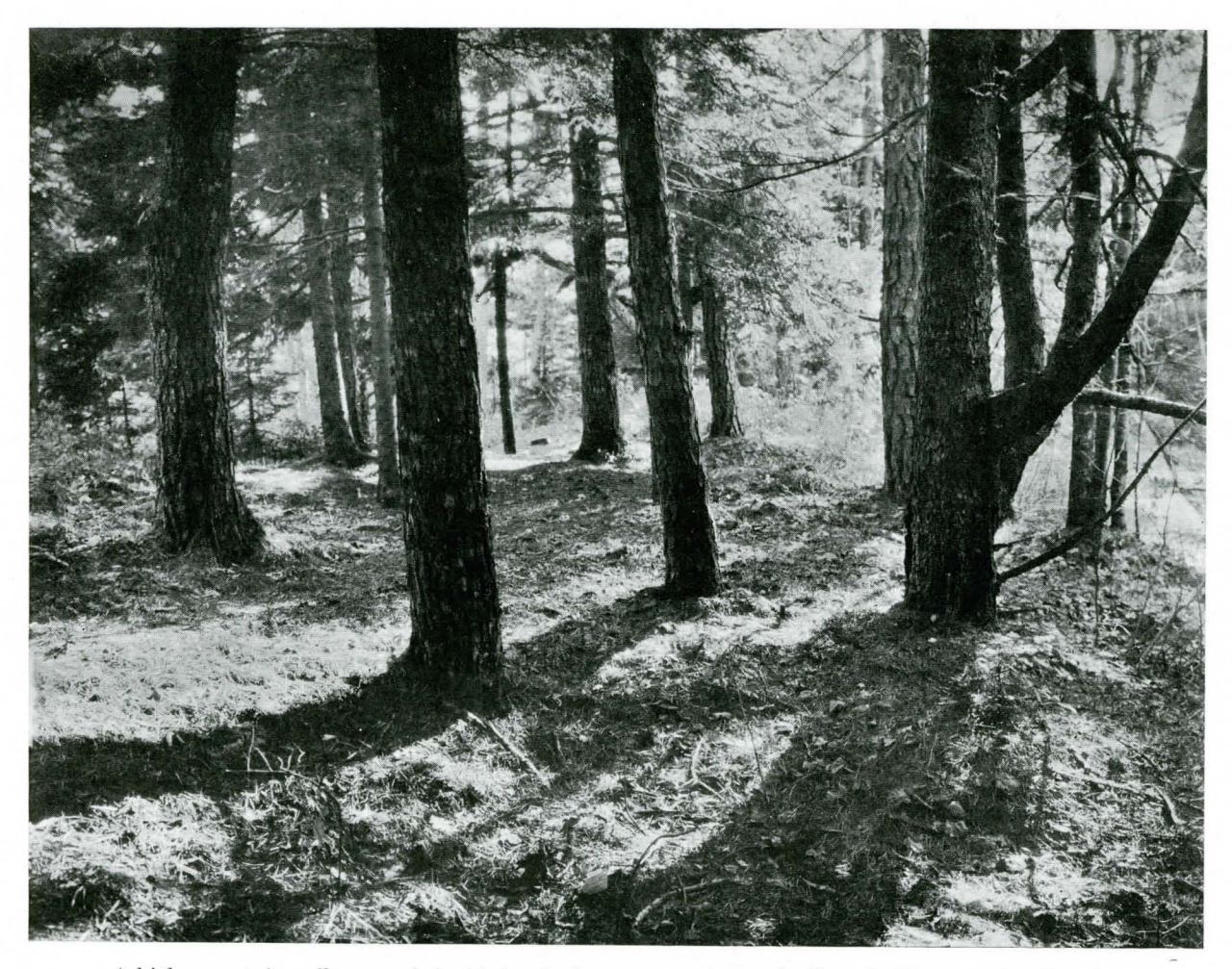
A high mountain valley, wooded with hemlock, spruce, and pine, in Sieur de Monts national park