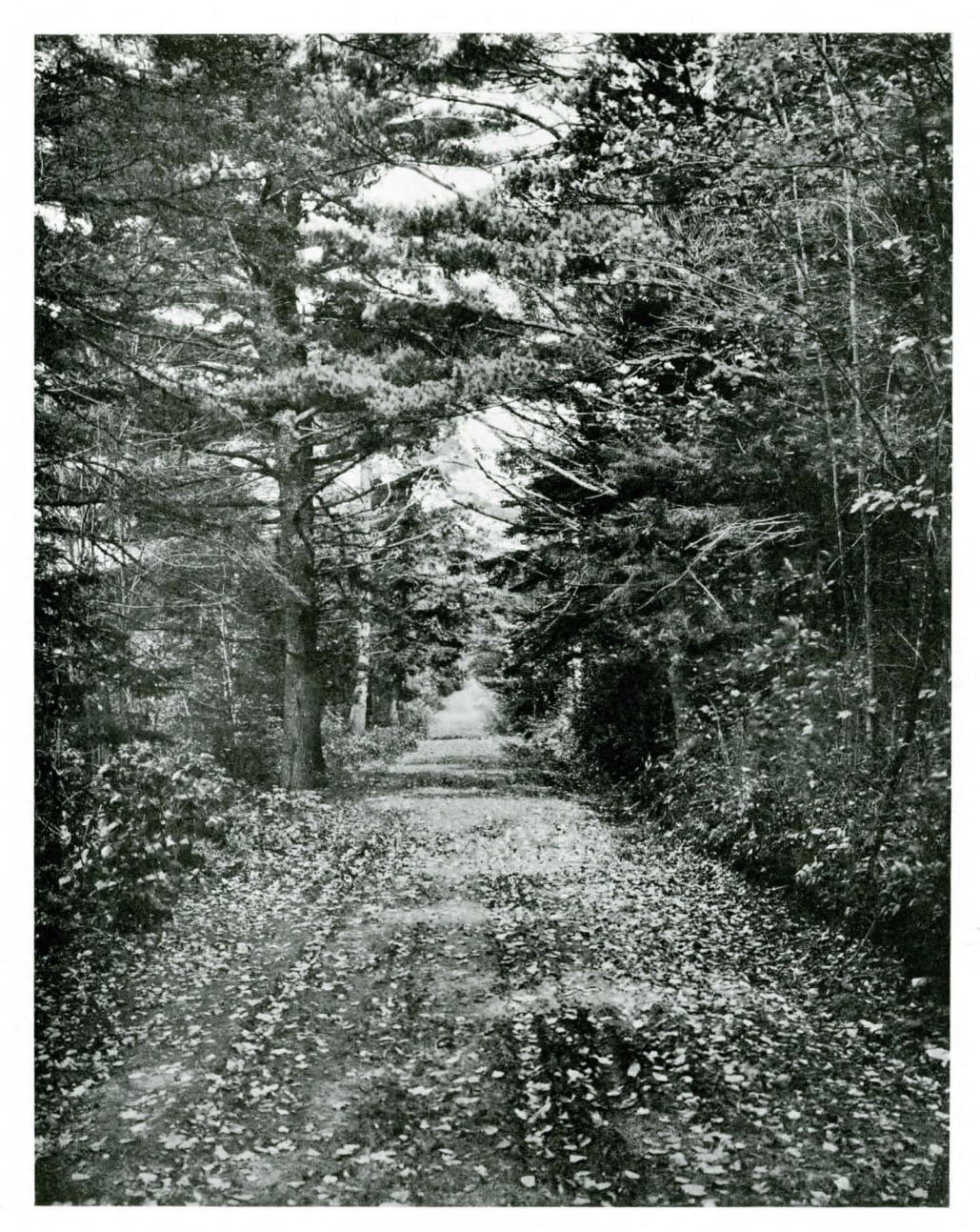
Sieur de Monts Spring road, passing through a rare bit of Primeval Forest in the national park