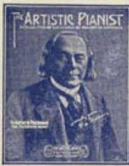
VLADIMIR DE PACHMANN