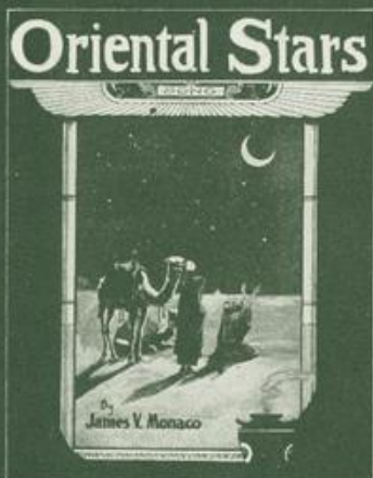
ONE STEP SONG