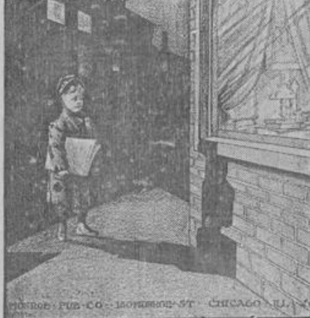
CHICAGO PUB. CO. 1409 BROADWAY ST. CHICAGO, ILL.