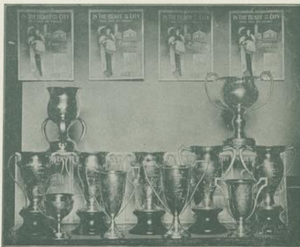
A FEW OF THE CUPS WON IN THE THEATRES ON THIS GREAT SONG

Copyright MCMXXIII by Daly, Music Publisher, Inc. 685 Washington St., Boston, Mass. International Copyright secured.