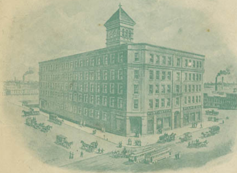
THE HUNTINGTON FACTORY, SHELTON, CONN.

T HE history of the Huntington Piano has been one continuous march of success—achievement after achievement—until to-day its musical triumphs have reached every quarter of the globe. It is the best piano sold anywhere to-day for the money, as the greatest musical artists and thousands and thousands who have them in their homes have testified. It has original features of construction that give it distinctive advantages over other pianos. It is built with the greatest care, skill and honesty, and its genuine value always impresses itself upon every purchaser. No one can dispute its reliability or question its artistic perfection. It is a piano that immediately attaches itself to the musician and a thing of joy and pride to its owner. Its rich tone has great volume and purity. Its action is perfect, responding to the slightest touch. The cases are of the most modern artistic designs