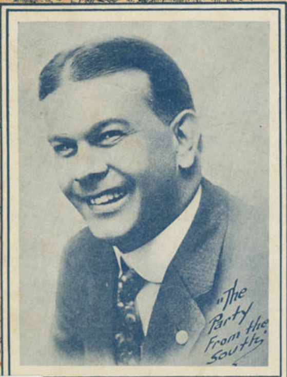
"The Party From the South"