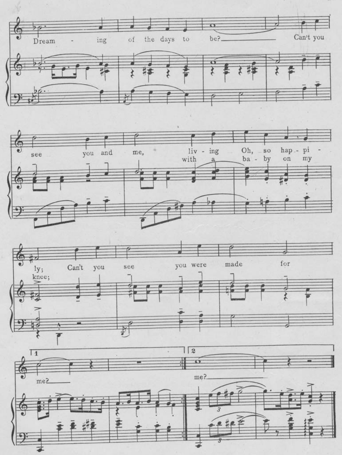
Can't You See? -3