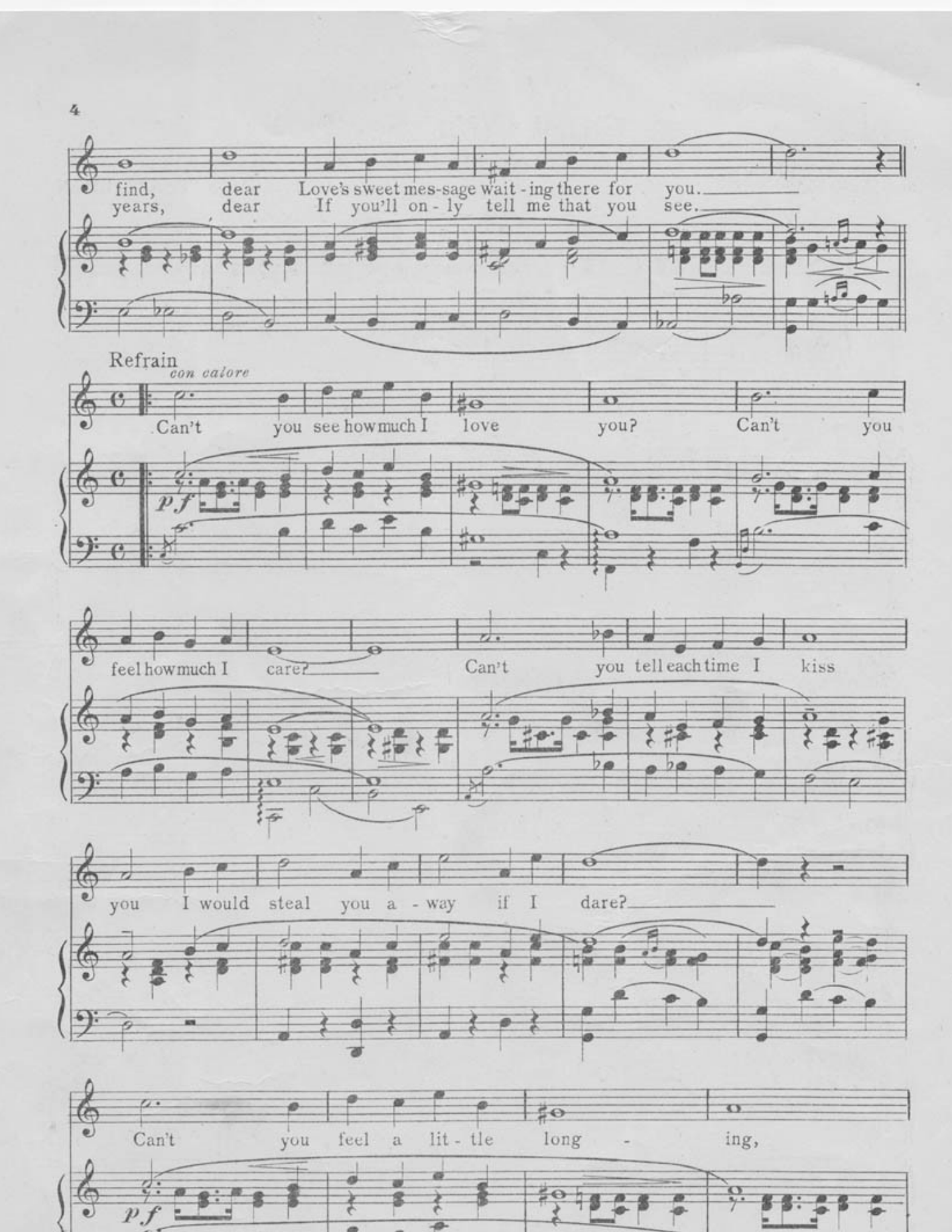
Can't You See? - 3