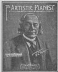
VLADIMIR DE PACHMANN