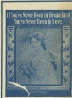
If You've Never Been in Dreamland You've Never Been in Love.