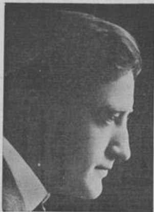
FRANCIS X. BUSHMAN