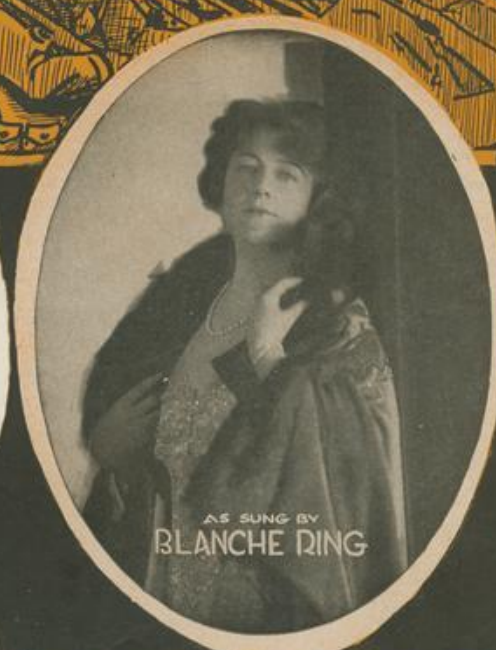
AS SUNG BY BLANCHE RING