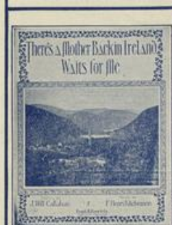
Beautiful Song—Appealing Words