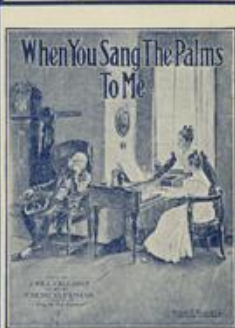
Appeals to Everybody