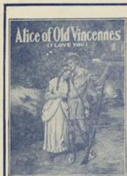
Another "Lonesome Pine"