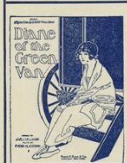
Adapted from $10,000 Prize Novel