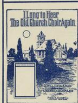
A Beautiful Home Ballad