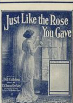
Ballad of Rare Beauty

Complete Copies on Sale Wherever Music is Sold!