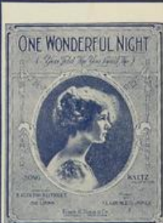
A Wonderful Waltz Song