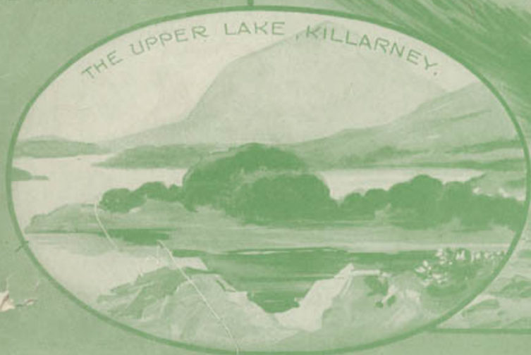
THE UPPER LAKE, KILLARNEY.