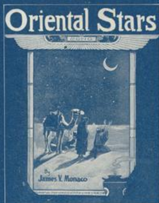
ONE STEP SONG