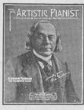
VLADIMIR DE PACHMANN