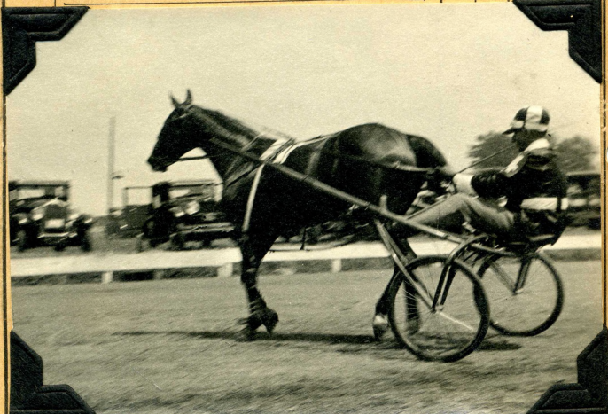
- Jolly Girl -