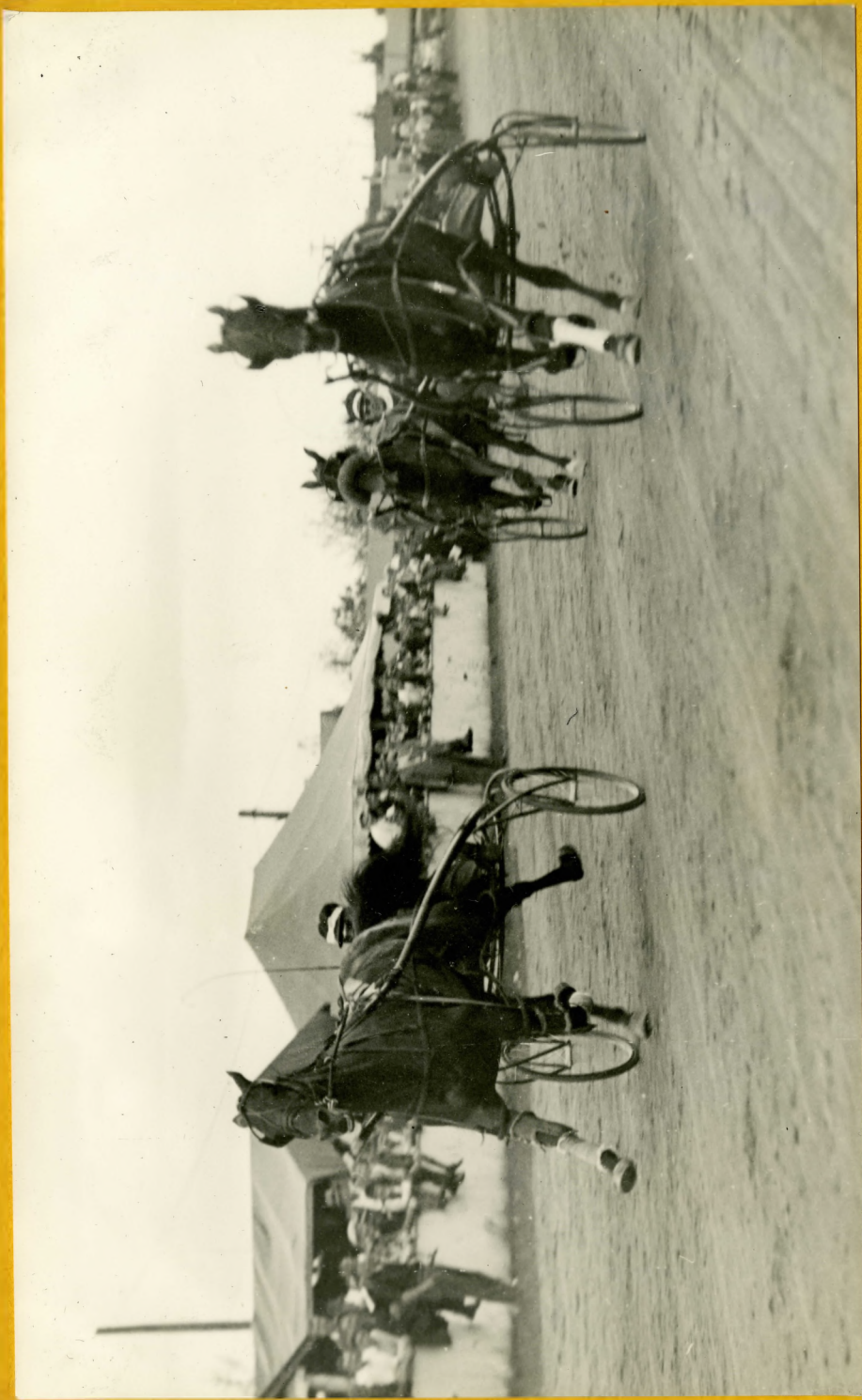
Coquette wins 1 st heat 2.18 Class