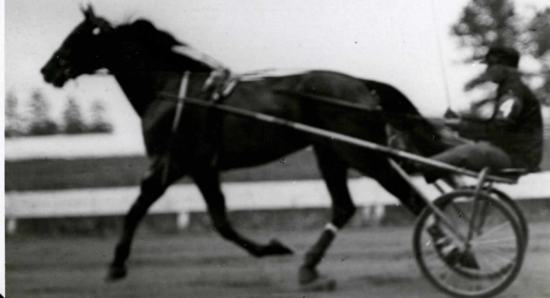
— Eyebright —

.06 \frac{1}{4} .05 \frac{3}{4} * * New Track Record