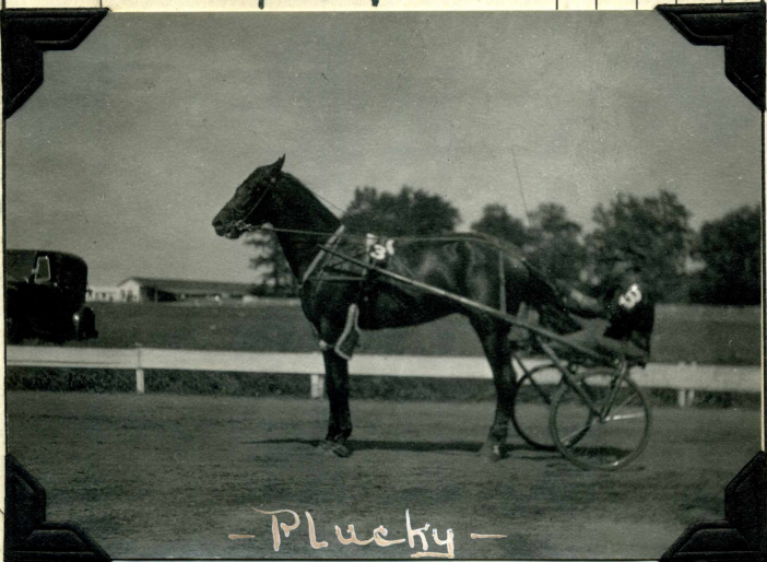
— Plucky —