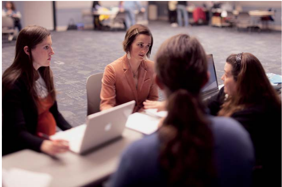
Volunteers at a TLC document clinic.