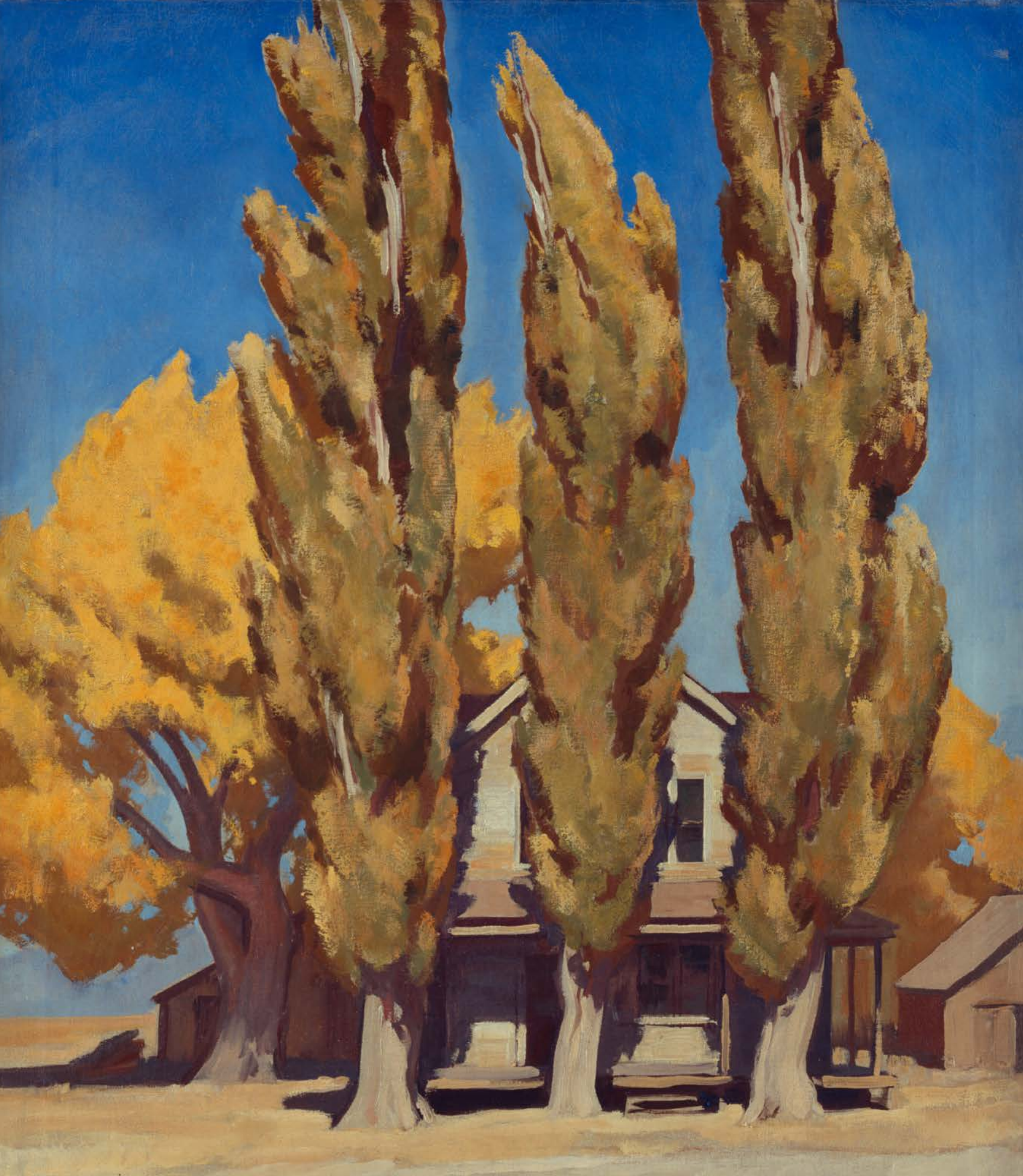
MAYNARD DIXON FARMER NOV 1935