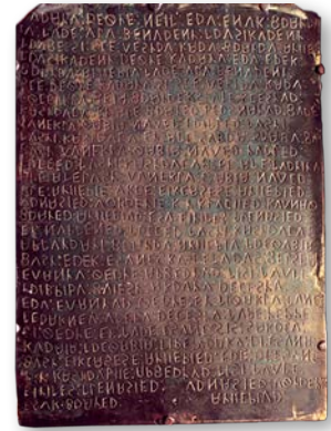
Important legal documents were preserved on metal plates in many ancient cultures. BYU owns this rare set of doubled, sealed, and witnessed Roman plates (left and center) from AD 109. (Left: front of plate 1; Center: back of plate 2.) The plate from Gubbio, Italy, (right) presents an Iguvine law (ca. 200 BC) in the Umbrian language using an Etruscan script.

JW: Doubled, witnessed, and sealed documents were virtually universal. They are found in many cultures, languages, and media. Archaeologists have found all kinds of documents—deeds, manumissions, bills of divorcement, promissory notes—using Latin, Greek, Hebrew, and Akkadian and written on clay, papyrus, parchment, wood, and metal.