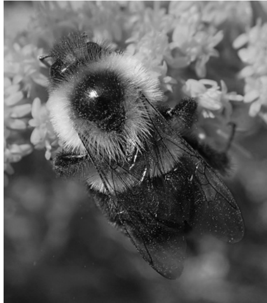
Above: Bombus impatiens, the common eastern bumble bee, Below: Bombus terricola, the yellow-banded bumble bee.