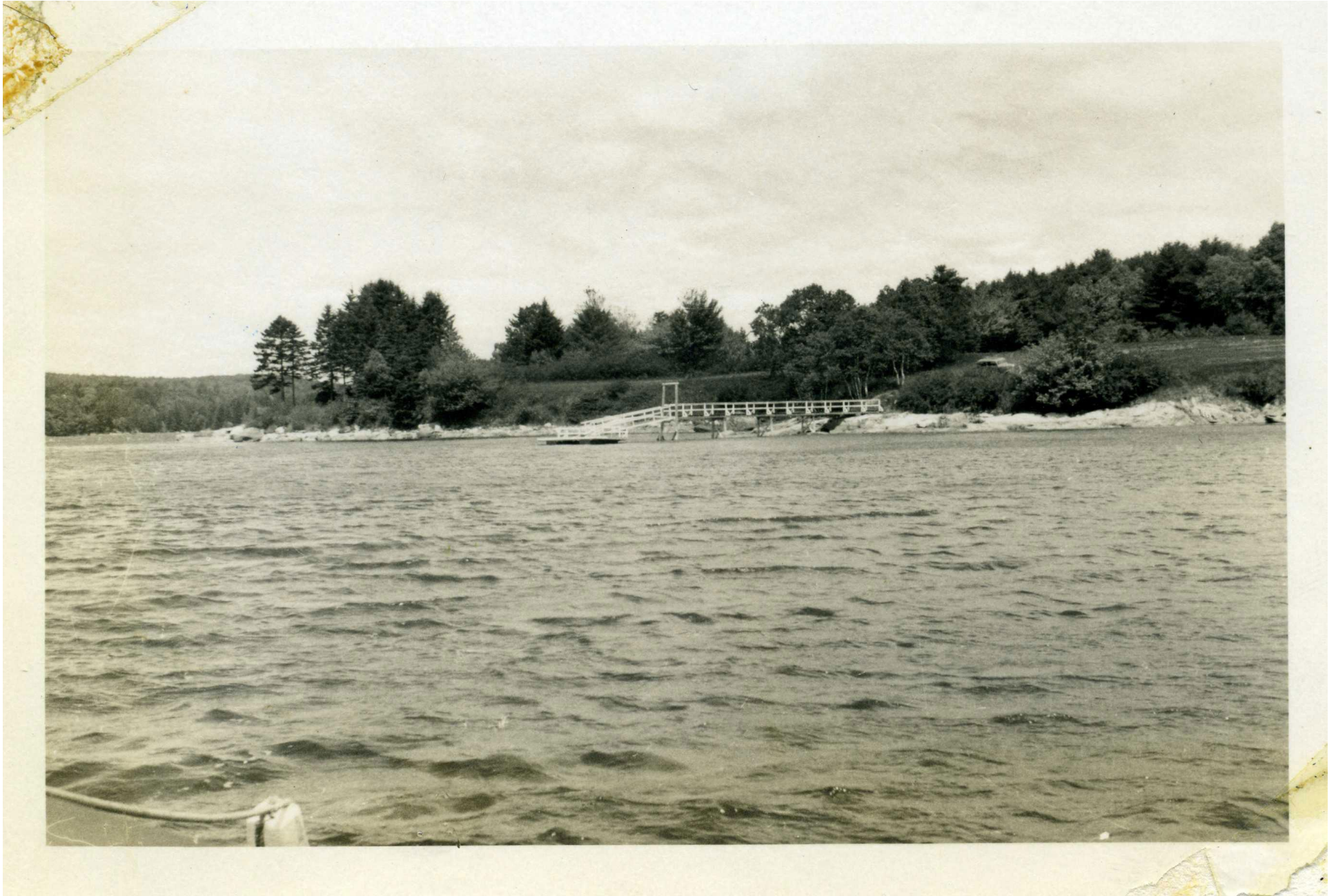
Picture 2: Approaching the Wentworth Point Pier. This photo and the following photos are estimated to be taken in the 1940s.