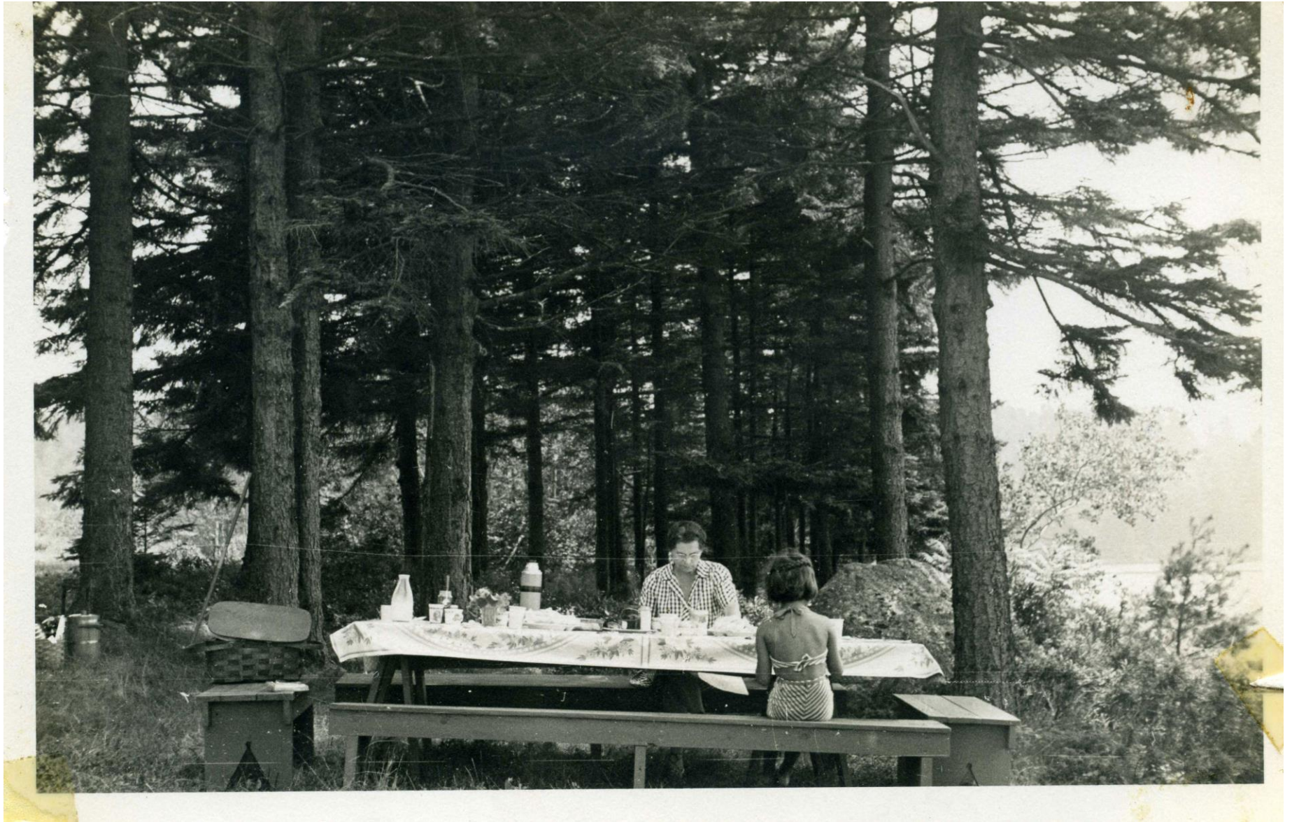
Picture 13: Agatha Birkhoff Darling and her granddaughter Wendy. Picnics were held at The Point – local lobsters were boiled over a wood fire in a huge pot – somewhere near the wharf – always called The Dock. Randall Rice would go down to empty the lobster pots.