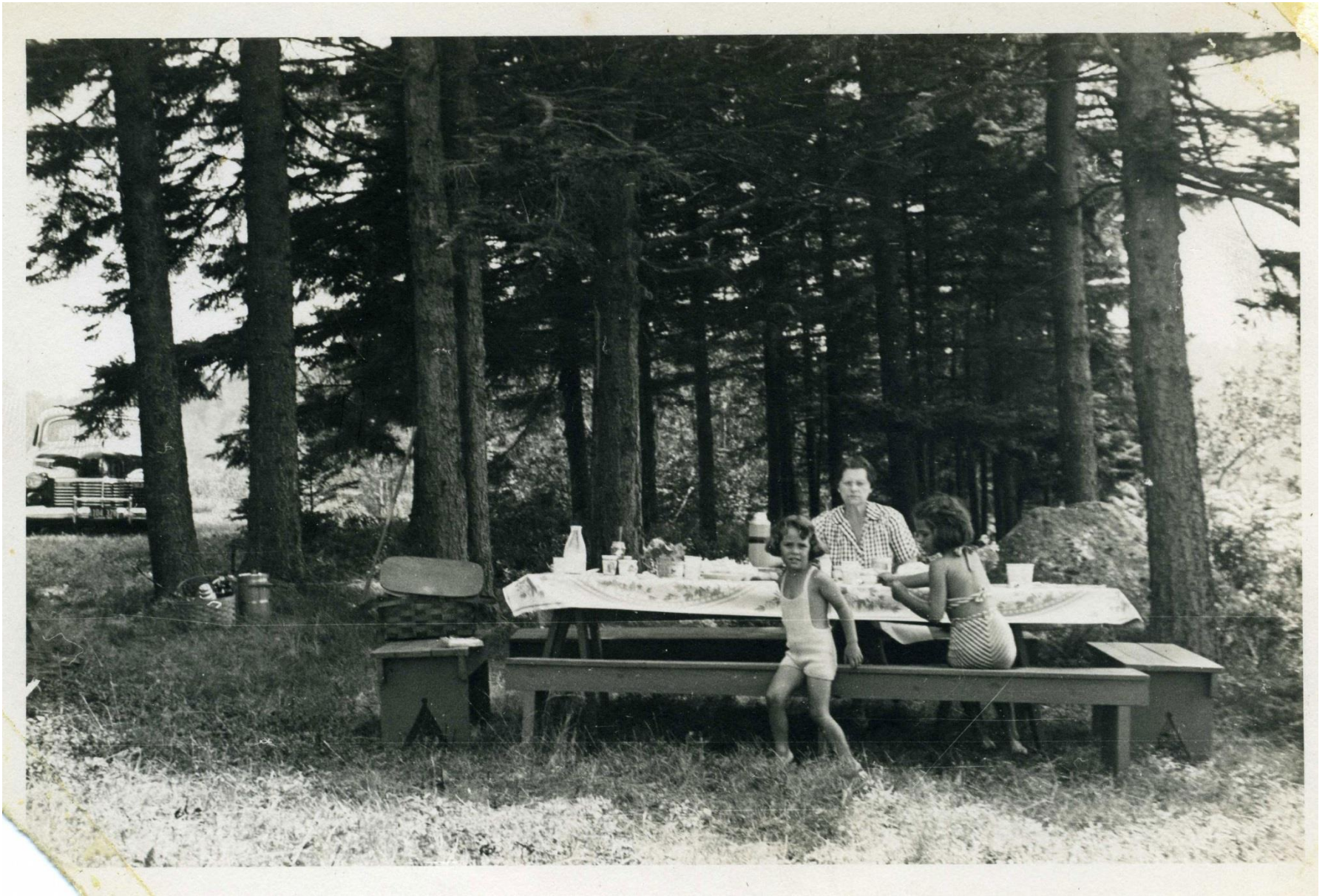
Picture 16: From left to right Wendy's sister Jane-Ray, Agatha Darling, and Wendy.