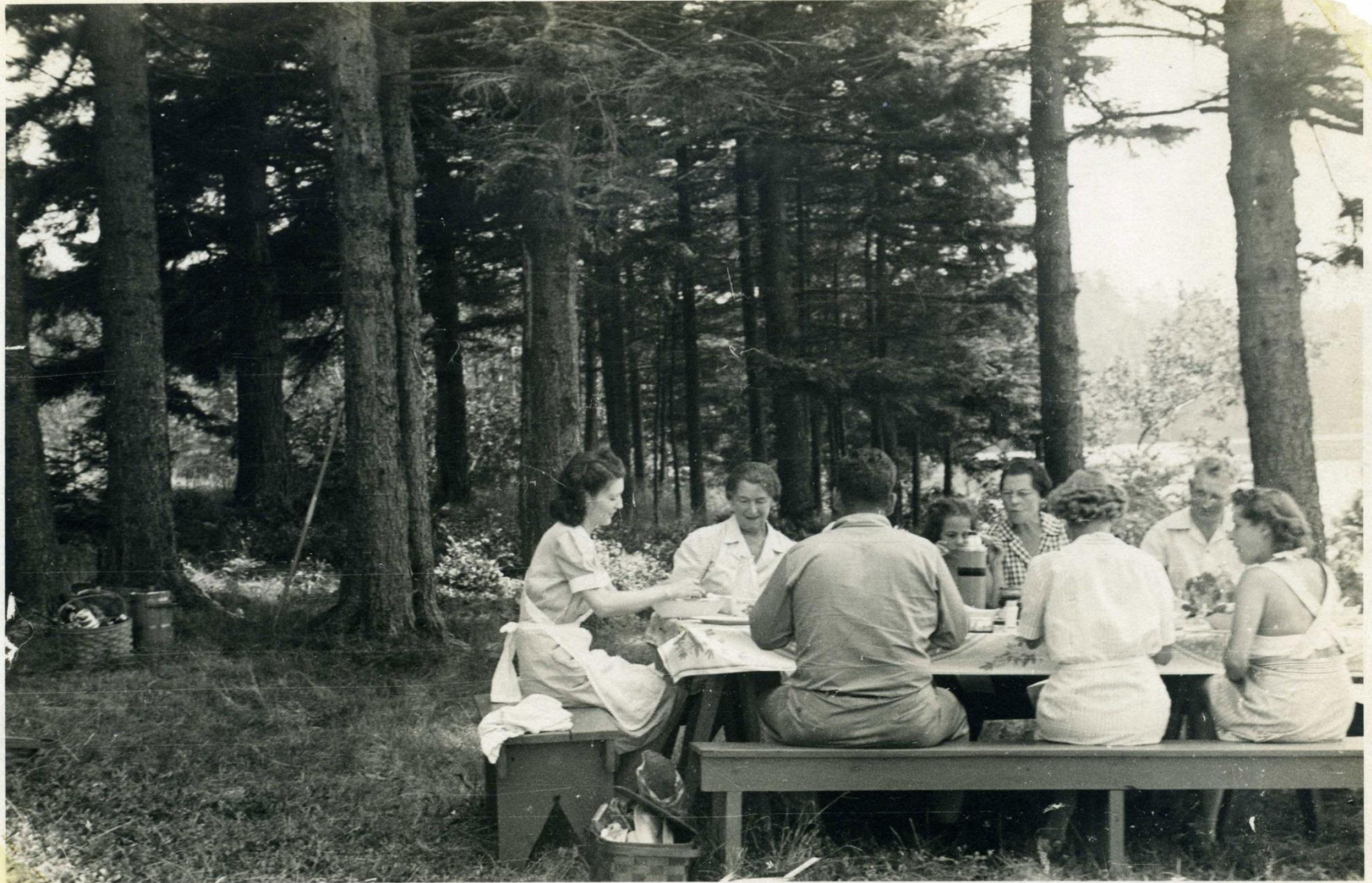
Picture 17: Picnic at the Point. Notice Ira is not in any of these pictures.