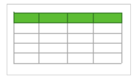
Table 1. Study sample characteristics according to physical activity levels in MSLS and ORISCAV-LUX studies.

Table 1 shows the demographic variables, dietary intakes, PA levels, and other health-related variables for MSLS and ORISCAV-LUX participants. A similar proportion of subjects from each study had poor PA levels (10%–11%), but a greater propotion in ORISCAV-LUX met ideal levels (67%) than in the MSLS (56%). Overall, weekly PA time was over two times higher in the Luxembourg sample than in the Central NY sample. In both study samples, those who had ideal PA levels also had significantly lower blood pressure, triglyceride and CRP levels, lower BMI, and higher HDL-cholesterol, compared to those who had poor PA levels. From a dietary perspective, participants with ideal PA levels also consumed significantly more fruit and vegetables than those with both poor or intermediate PA levels.