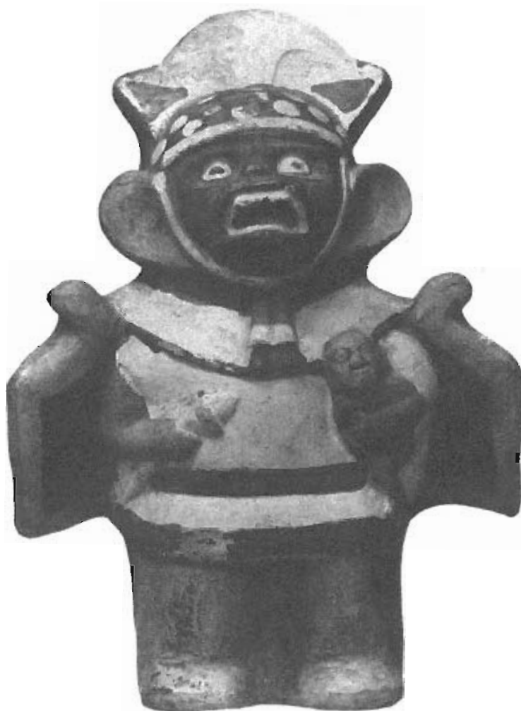
Figure 2. Mochica vessel. Anthropomorphic bat with warrior's helmet, holding warclub and captive figure. Photo courtesy Museum für Völkerkunde Berlin, Staatliche Museen Preussischer Kulturbesitz (VA 18083).