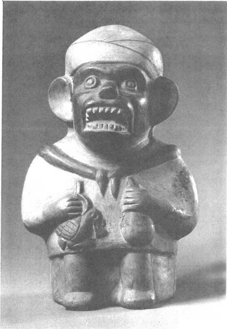
Figure 3. Mochica vessel. Anthropomorphic bat holding a stirrup-spout vessel and a dipper. Photo courtesy Museum für Völkerkunde Berlin, Staatliche Museen Preussischer Kulturbesitz (VA 4623).