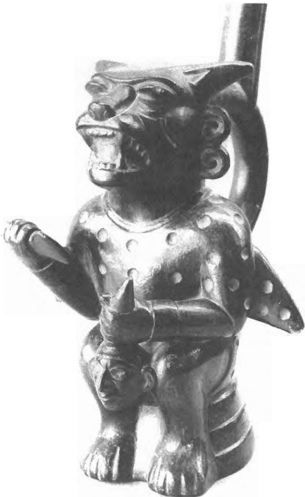
Figure 1. Mochica vessel. Anthropomorphic bat with knife and trophy head. Museo Nacional de Antropología, Lima.