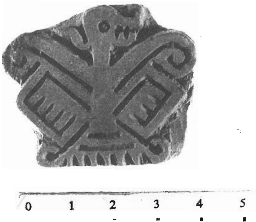
Figure 10. Manteño sello. Museo del Banco Central del Ecuador, Guayaquil (GA-2-125-76).