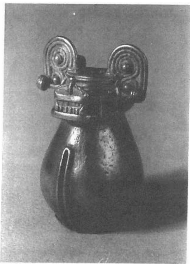
Figure 7. Tairona pendant bell with bat head. Museo del Oro, Bogotá (14.855).