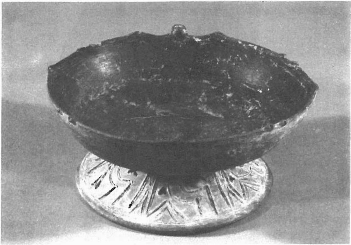
Figure 5. Chorrera bowl in form of a stylized bat with outspread wings. Central Manabí Province. Herbert F. Johnson Museum of Art, Cornell University, Ithaca (75.53.85).