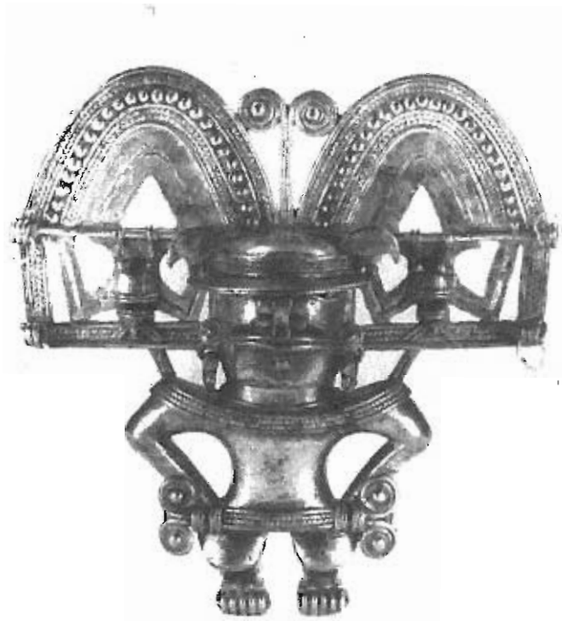
Figure 8. Tairona pendant with chiropteran nose and two bats suspended upside-down at the sides of the head. Museo del Oro, Bogotá (12.564).