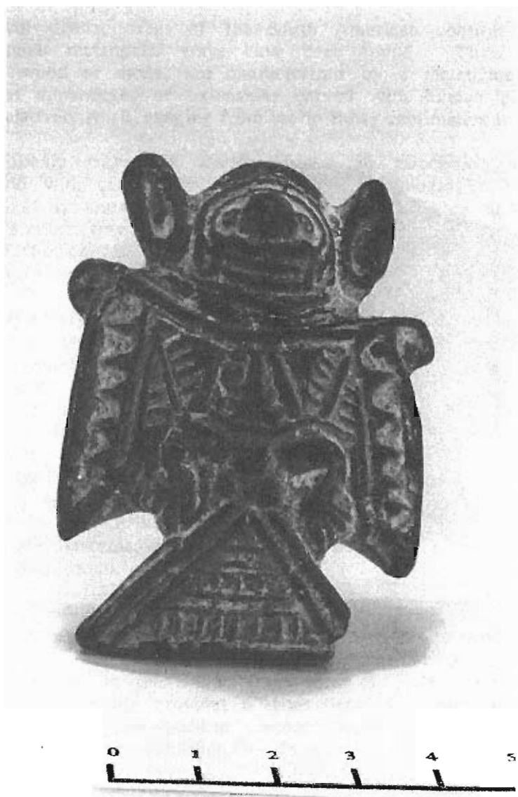
Figure 9. Manteño positive mold. Museo del Banco Central del Ecuador, Guayaquil (GA-11-598-78).