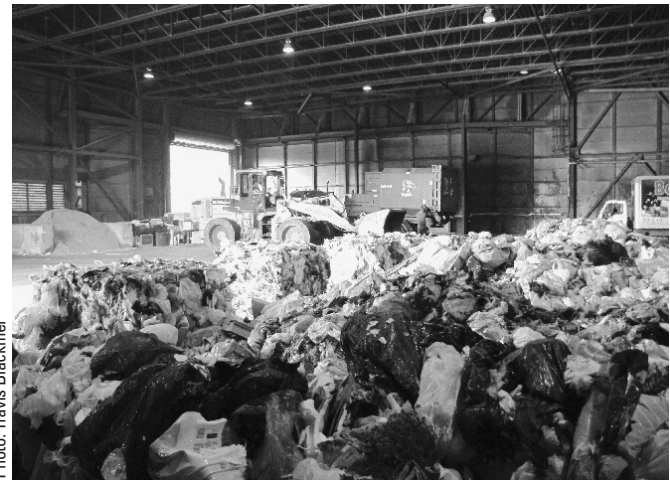
FIGURE 1: Materials Recovery at EcoMaine

In focusing "up the hierarchy," this review of best-practice state-level policies for waste reduction and recovery by no means suggests that waste-handling technologies, processing methods, and disposal practices are unimportant parts of the materials-management puzzle. They are certainly essential, but they are not our focus here. We also recognize that the term best practice is