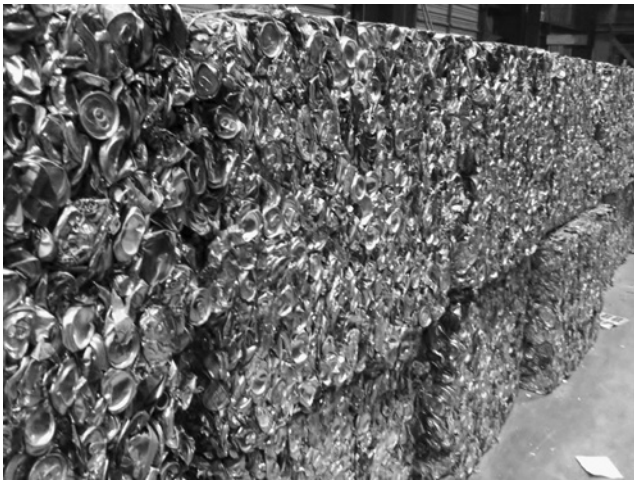
FIGURE 2: Beverage Containers Crushed, Baled and Ready for Sale