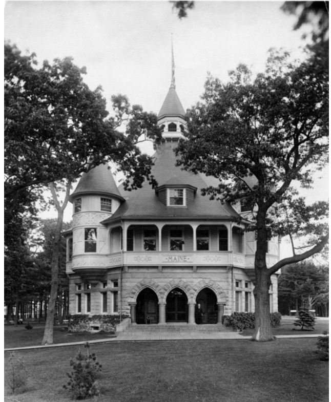
The Maine State Building at the Poland Spring resort was built of various types of Maine granite, slate, and wood for the 1893 World's Columbian Exposition in Chicago. At the end of the fair, the owners of Poland Spring bought the building, had it taken apart, and transported it on 16 rail cars. The building was reassembled and modified somewhat. It was opened in the summer of 1895 and housed a library, the "Hill-Top" newspaper office, art gallery, and a museum.

Schools: Schools offer technology-savvy students, up-to-date computer equipment, and high-speed Internet access. Participation provides students with opportunities to do research, think critically, write,