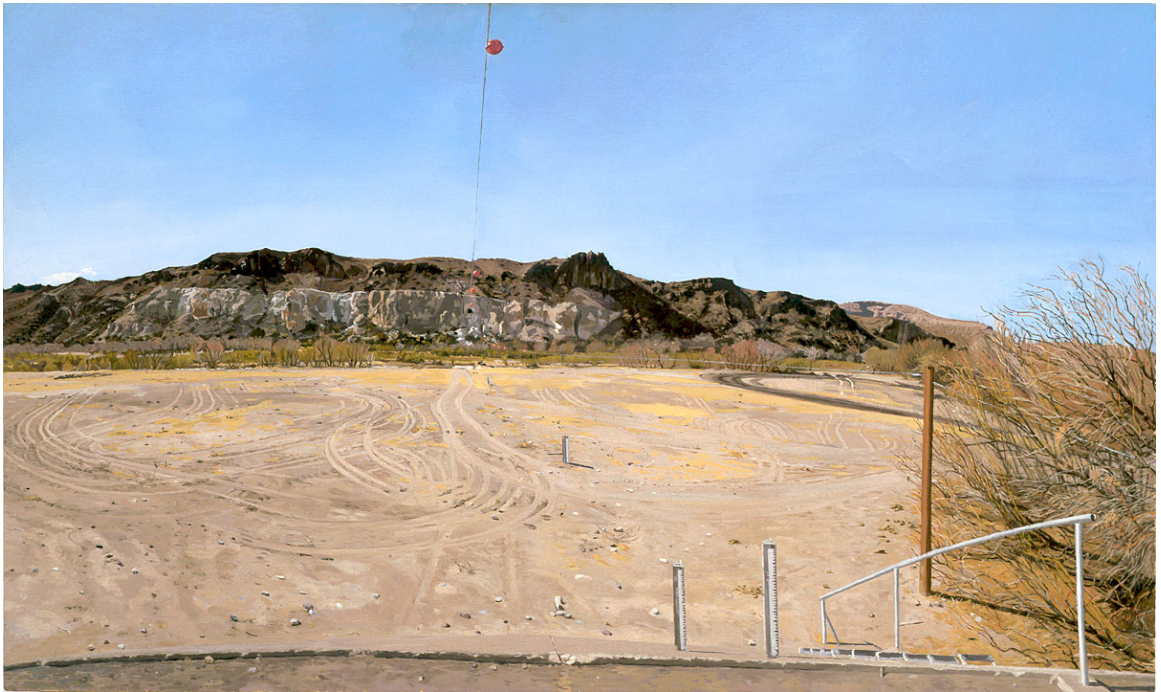
Figure 5: Downes, Rackstraw Water-Flow Monitoring Installations on the Rio Grande Near Presidio, TX (5-Part Painting): Part 2: Facing South, The Flood-Plain from East of the Gauge Shelter, 10 A.M. (2002-3). Oil on canvas, 28.5 x 48" (72.4 x 121.9 cm).

himself from the popular movement of the time by insisting on painting from life, out of doors in the landscape itself. These plein air paintings are hardly on a scale Cézanne could have carried on his hour's walk to his site, some measuring up to ten feet wide, though frequently less than two feet tall. Water-Flow Monitoring Installations on the Rio Grande Near Presido, TX , a five-part painting, would total over seventeen feet stretched end to end; despite the image's seeming instantaneousness and wholeness, we cannot perceive it this way except from a distance: "difficult to absorb fully at once...the eye can take them in only piecemeal" or else, from a distance, where the detail is lost. 223 Even in his own perception in the act of painting, Downes' turning of his head in forming such a wide panorama results in his preference for the curved edges of the horizon, a unique