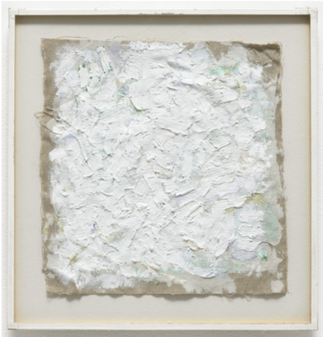
Figure 1: Robert Ryman, Untitled (1961). Oil on unstretched linen. 10 ¾ x 10 ¼" (27.3 x 26 cm).

Paint. Thick, white, fingerlike strokes brush shoulders with each other, converge, gather, greet one another, cluster, halt suddenly, diverge, arc, twist, break. They assert themselves purposefully, determinedly over occasional pale tints of chartreuse and soft cerulean, scrubbed and dripped discreetly onto a thin, translucent layer of primer. Edges