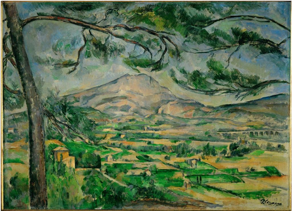
Figure 4: Paul Cézanne, Mont Sainte-Victoire (1885-1887). Oil on canvas. 26 x 35 3/8".