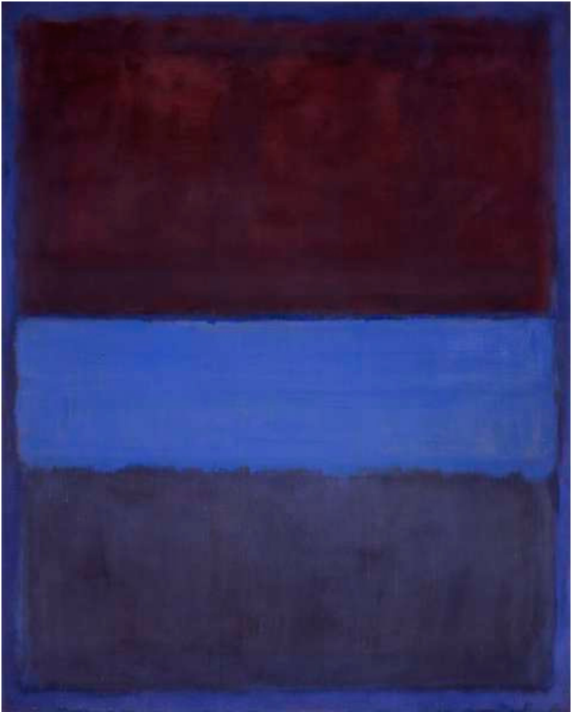
Figure 3: Mark Rothko, Number 61 (Brown, Blue, Brown on Blue) (1953). Oil on canvas. 116½ x 92”.