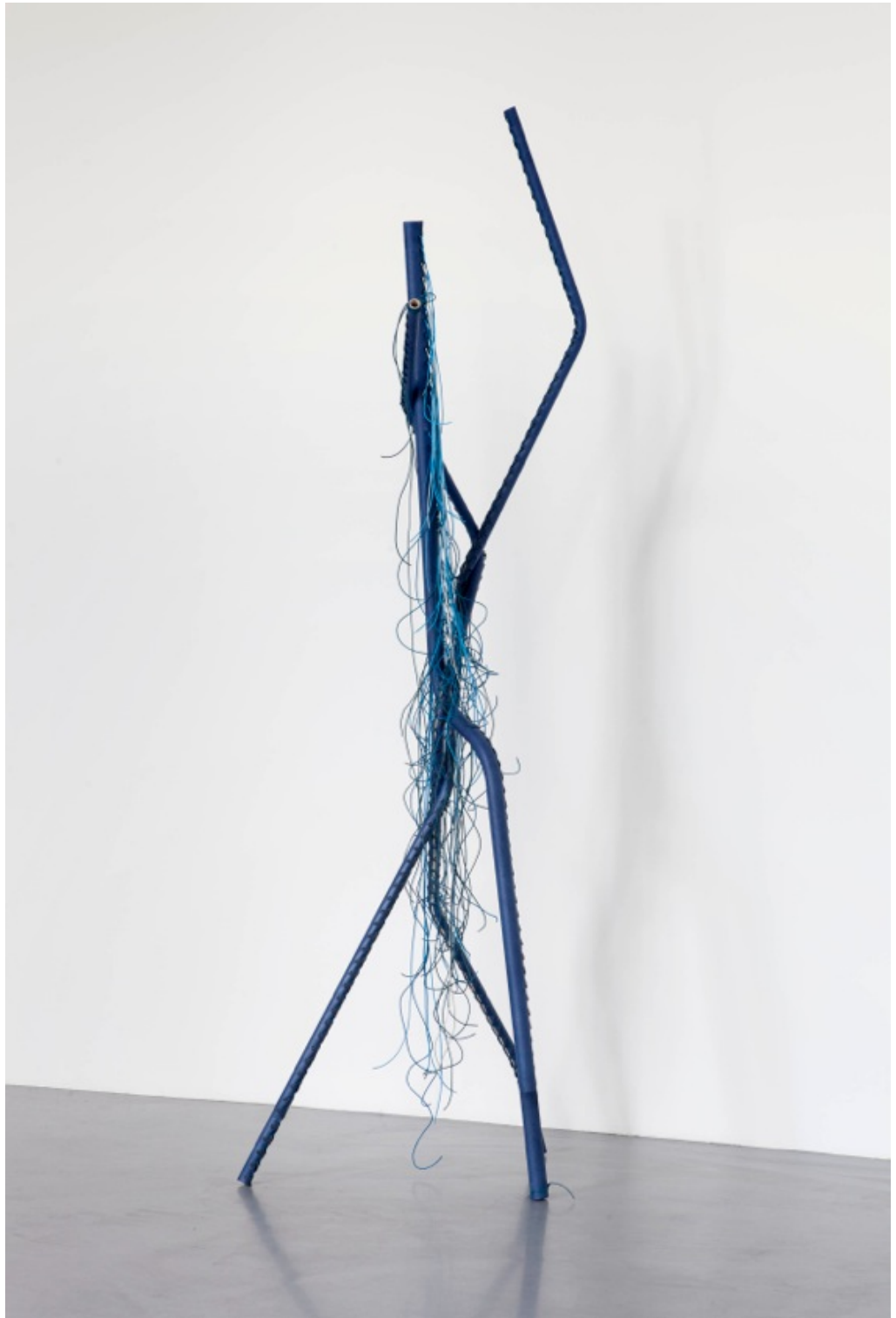
Figure 8: Trouvé, Tatiana. Untitled (2008). Metal, leather, epoxy paint.