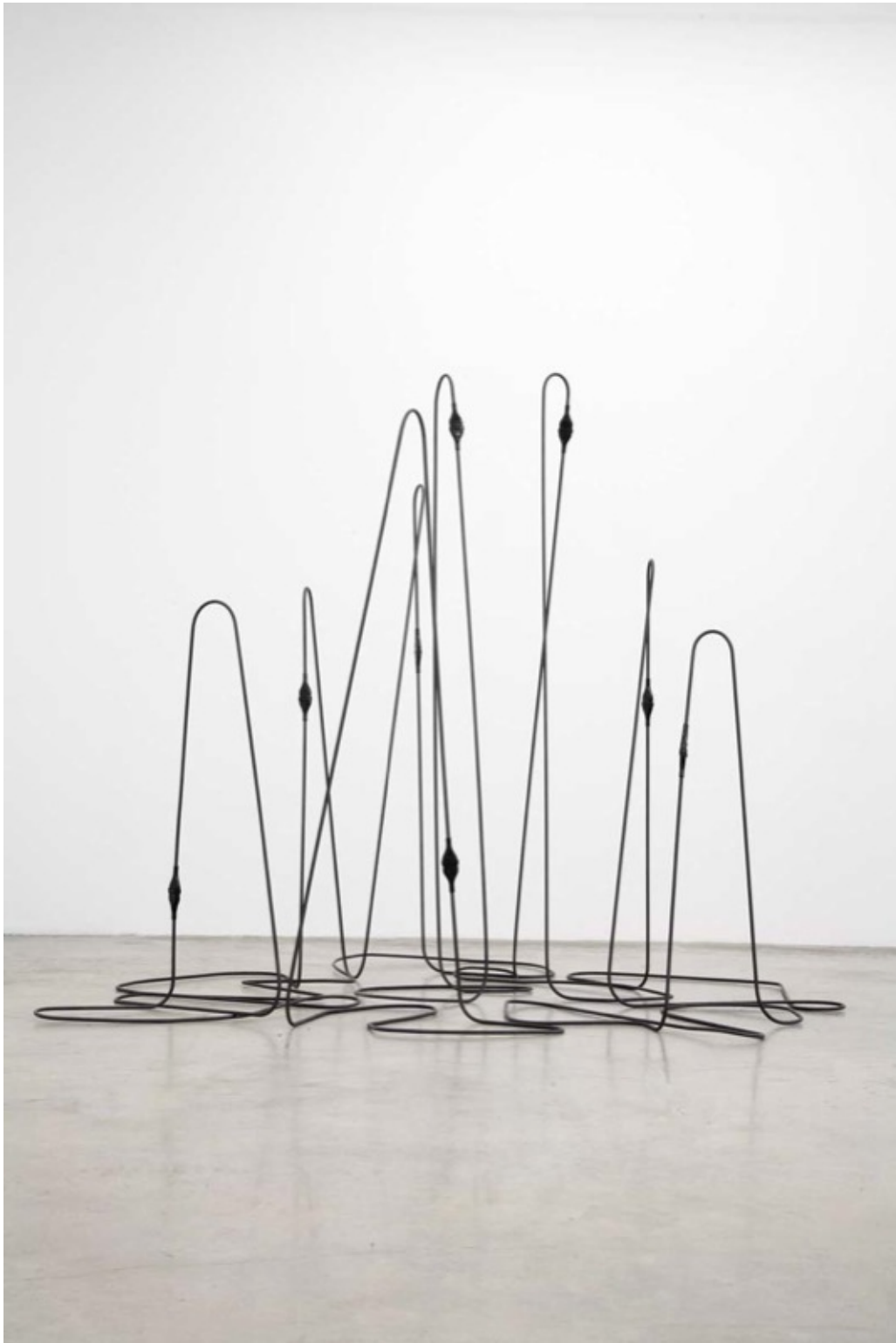
Figure 7: Trouvé, Tatiana Untitled (2008). Metal, rubber. 7.1 x 8.9 x 7.10 ft