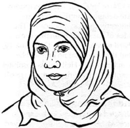
Figure 1: Hijab

http://www.oocities.org/puteriumnomy/hijab.html