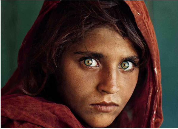
Figure 4: Afghan Girl from 1985 National Geographic Story

http://ngm.nationalgeographic.com/2002/04/afghan-girl/original-story-text