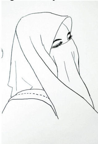
Figure 3: Niqab

http://islamicartdb.com/wp-content/uploads/2012/11/niqab-line-drawing.jpg