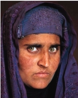
Figure 6: Afghan Girl Revealed, 2002

http://www.jmu.edu/lexia/images/afghan_girl2.jpg