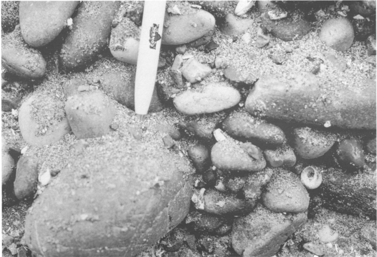
Figure 1. Borrow pit profile in Ridge IIa showing Prisogaster shells in situ , associated with their opercula.

bars (Wells's Morphostratigraphic Group I), and subaerial ridges (Morphostratigraphic Groups II–IV) began forming only after that date with the onset of ENSO rainfall providing the necessary sediment pulse for episodic ridge formation. This is the version that we have proposed in prior publications (SANDWEISS et al. , 1983; SANDWEISS, 1986). A possible analog for conditions prior to ridge formation is found in the Guañape bay north of the Virú valley, some 65 km north of the Santa region. There, an open embayment in the lee of a rocky promontory still provides a habitat for mollusks such as Tagelus dombeii (contra DEVRIES and WELLS, 1990; WELLS 1996 re. Tagelus ecology). Prior to formation of the Santa beach ridge plain, the Santa paleoembayment was sheltered by a rocky promontory (see WELLS, 1996:Figure 4A and B), but we are uncertain whether the geometry is correct to prevent formation of a barrier in front of the paleoembayment. This leads us to the second scenario, closer to WELLS's (1996) most recent version. Here, Ridge IIa represents the final position of a transgressive barrier that was migrating inland for several thousand years in a framework of rising sea level (Figure 2A), as WELLS (1996) suggests. As she indicates in the text, this barrier must have been broken by tidal channels, to account for the mollusk and fish found in the Ostra beach and associated archaeological sites. Around