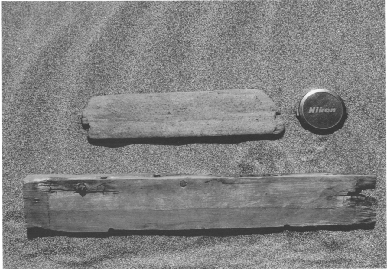
Figure 4. Worked driftwood with nails from the Santa beach ridges.

ago, clearly shows large palisades of driftwood on all of the ridge sets (Figure 3). Firewood collection on the ridges most easily reached from the Panamerican Highway (built beginning in the 1920's) probably accounts for the disappearance of the easternmost driftwood deposits.