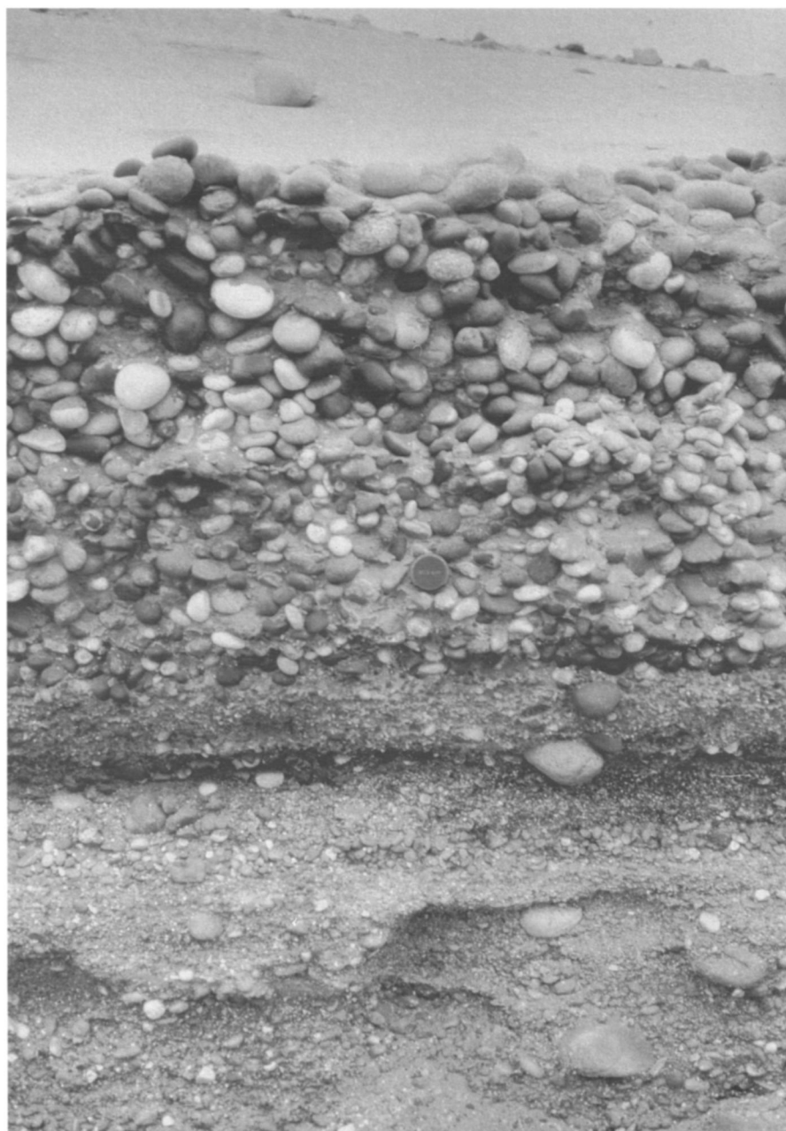
Figure 5. Borrow pit profile in Ridge IIa showing poorly sorted lower deposits with large subangular clasts.

explain the absence of ridge formation subsequent to the AD 1982–1983 El Niño event.” However, the dam in question (at Cañón del Pato) was built prior to the 1972 ENSO (WELLS, 1992, p. 197) which, following the strong seismic event of 1970, did precede formation of a ridge at the mouth of the Santa river (MOSELEY et al. , 1992). Low coastal deposition during the 1982–1983 event more likely resulted from the lack of local seismic activity after the 1970 earthquake and the prior transport of material produced then by the 1972 rains.