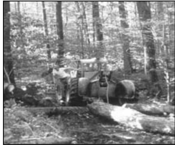
FIGURE 2.—Timber harvesting gives landowners the opportunity to alter the condition and density of their forest to serve a variety of objectives and generate revenue in the process.

new ones at appropriate times. And because trees of good form and marketable species have value for a host of products that people depend on for daily living, landowners can sell excess and mature trees to generate revenue and pay off their investments in ownership and management (figure 2).